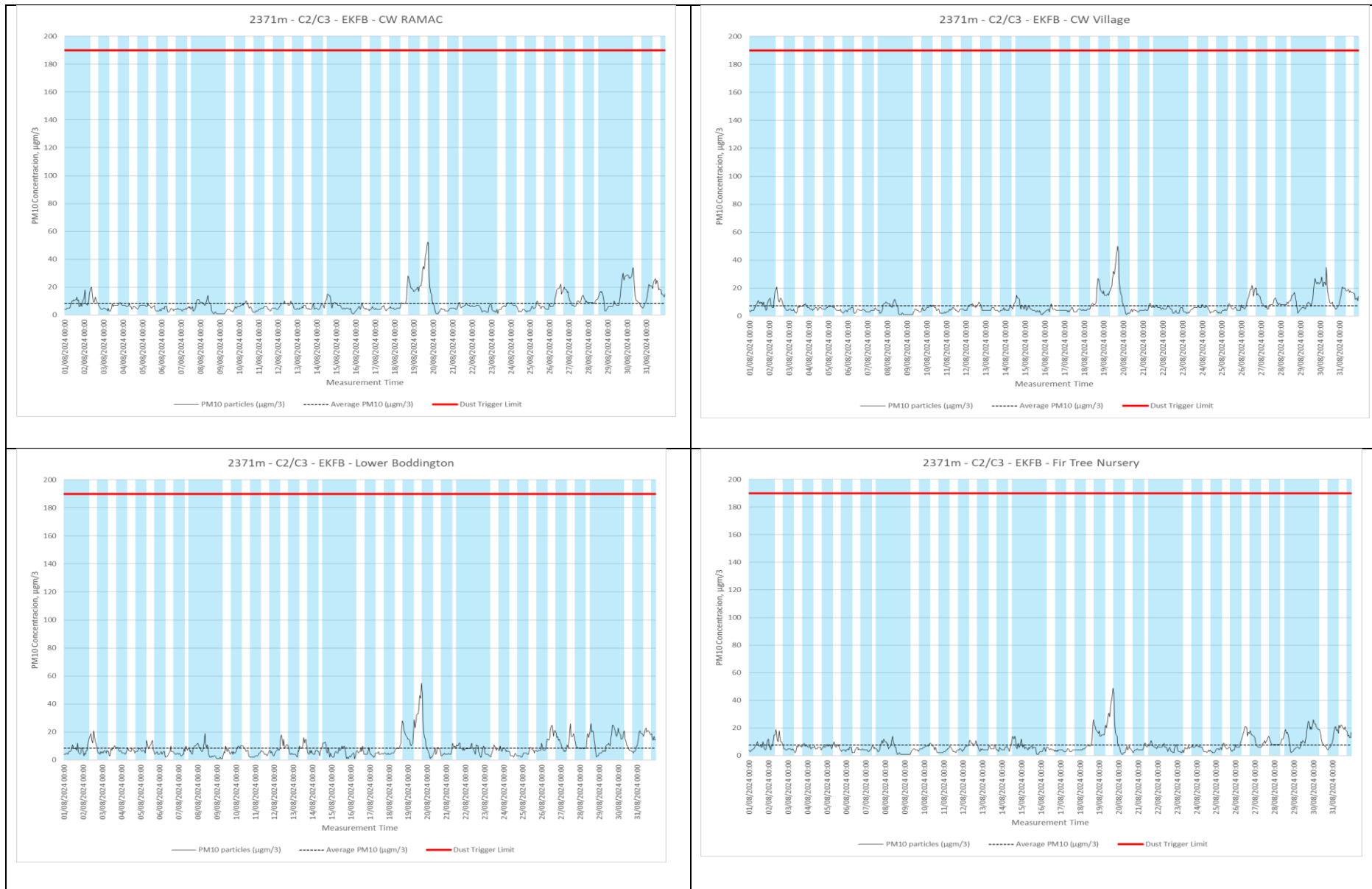
Figure 3: Continuous dust 1-hour mean indicative PM 10 concentration for all monitors