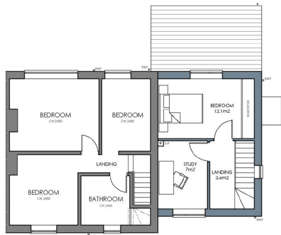
PROPOSED FIRST FLOOR PLAN 1:100 PLOT 1 - 1 BED, 2 PERSONS: 65.8m 2