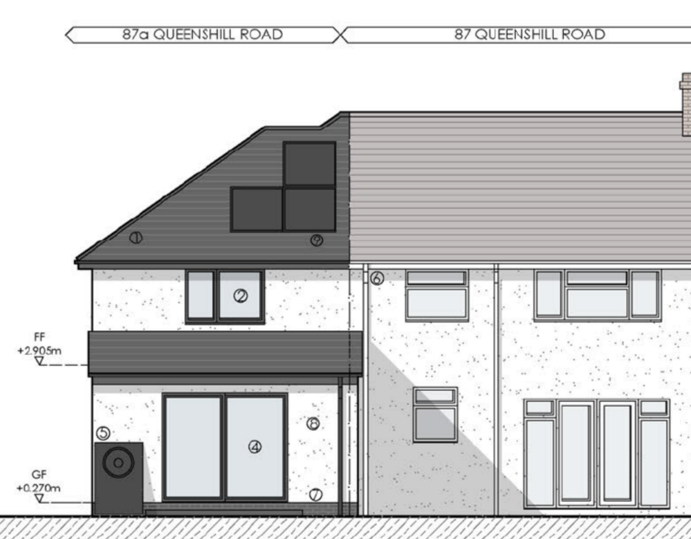
PROPOSED REAR ELEVATION 1:100 PLOT 1 - 1 BED, 2 PERSONS: 65.8m 2