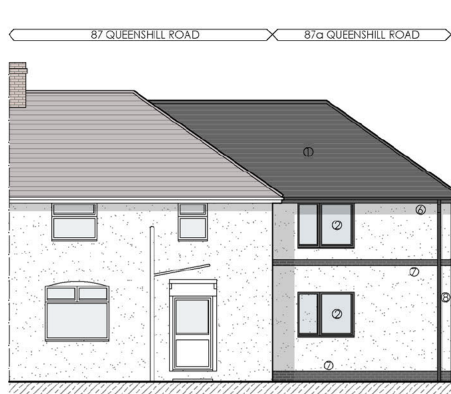
PROPOSED FRONT ELEVATION 1:100 PLOT 1 - 1 BED, 2 PERSONS: 65.8m 2