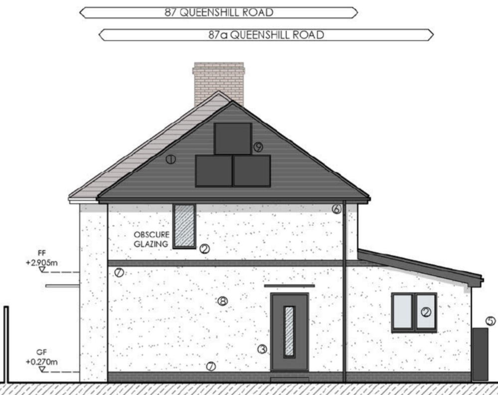
PROPOSED SIDE ELEVATION 1:100 PLOT 1 - 1 BED, 2 PERSONS: 65.8m 2