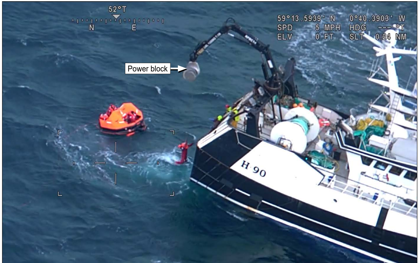
Figure 2: Power block recovery of the second crew member