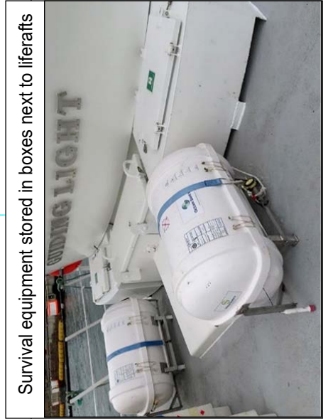
Survival equipment stored in boxes next to liferafts