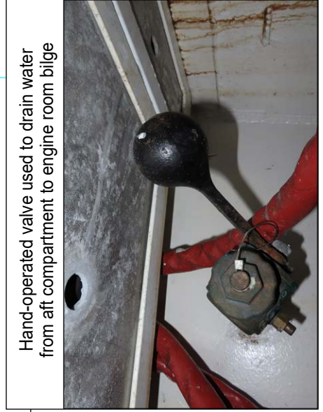
Hand-operated valve used to drain water from aft compartment to engine room bilge