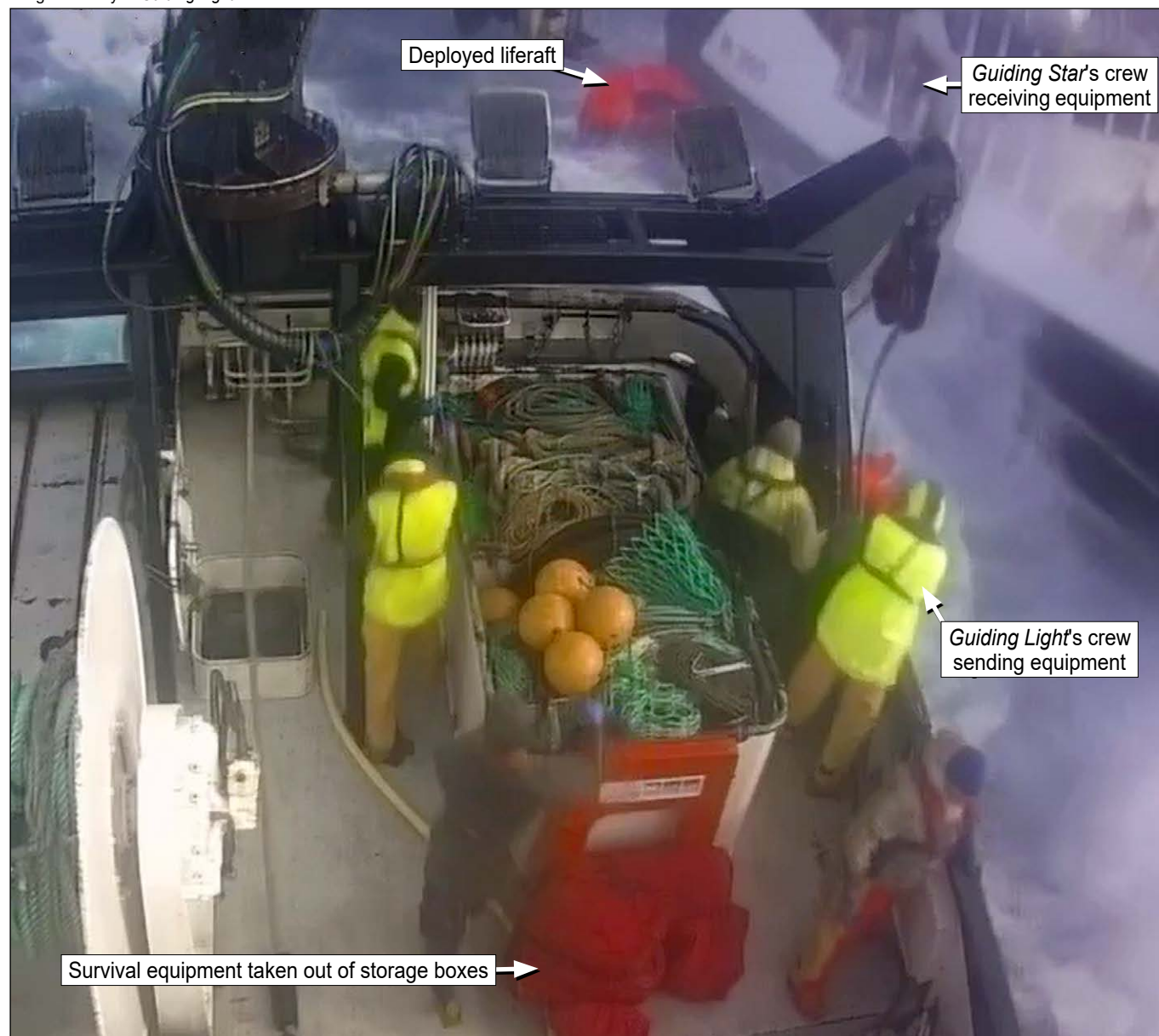
Figure 1: CCTV still, showing the transfer of survival equipment from Guiding Light to Guiding Star

Guiding Light's skipper steered the vessel close to the liferaft and the engineer used the power block to lower a rope to hoist two of Guiding Star's crew out of the liferaft and onto the quarterdeck. This was observed by the crew on board the rescue helicopter, which had just arrived on scene ( Figure 2 ). While trying to recover a third crew member, a large wave capsized the liferaft and its six occupants were thrown into the water. As Guiding Light was manoeuvred towards the overturned liferaft, the crew in the water grabbed hold of its lifelines. The power block was repositioned to lift three more crew members out of the water, including the skipper. At about 1249, Guiding Star became fully submerged by the stern, with its bow in the air. The radar continued to turn as the vessel sank. The rescue efforts were handed over to the coastguard rescue helicopter and its crew winched the last three Guiding Star crew members to safety between 1259 and 1312, before transferring them to hospital 3 . The five rescued crew members on board Guiding Light were checked over before the vessel departed the scene for Peterhead, Scotland, arriving at 0155 the following morning.