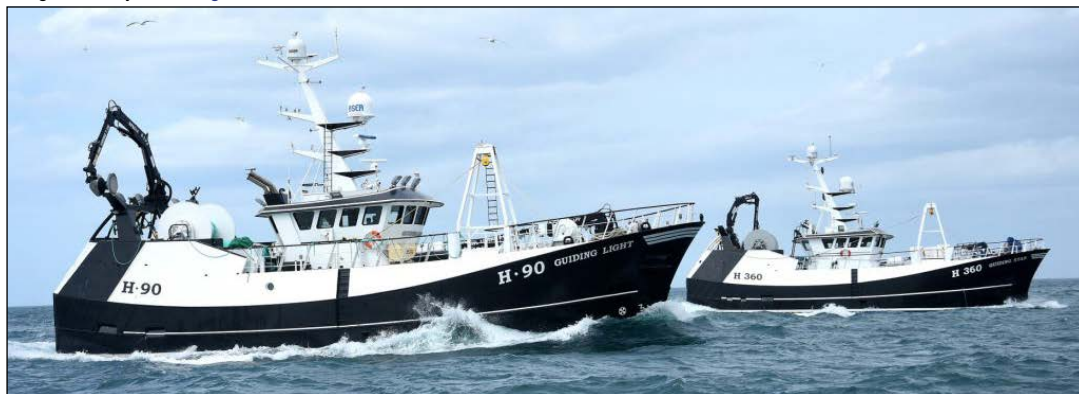
Guiding Light and Guiding Star