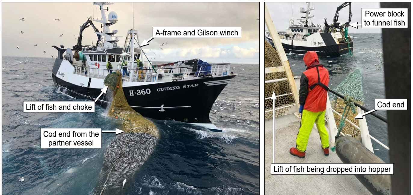
Figure 4: The relative position of each vessel during a fish transfer

that could pull the vessels together. The other skipper was not required to manoeuvre as this could increase the risk of the net fouling the propeller. Instead, they monitored the transfer and only intervened if necessary. The dog rope was disconnected when the cod end was empty, and the net was dropped into the water. The receiving vessel then moved astern to increase the sea room, while the other vessel retrieved the net.