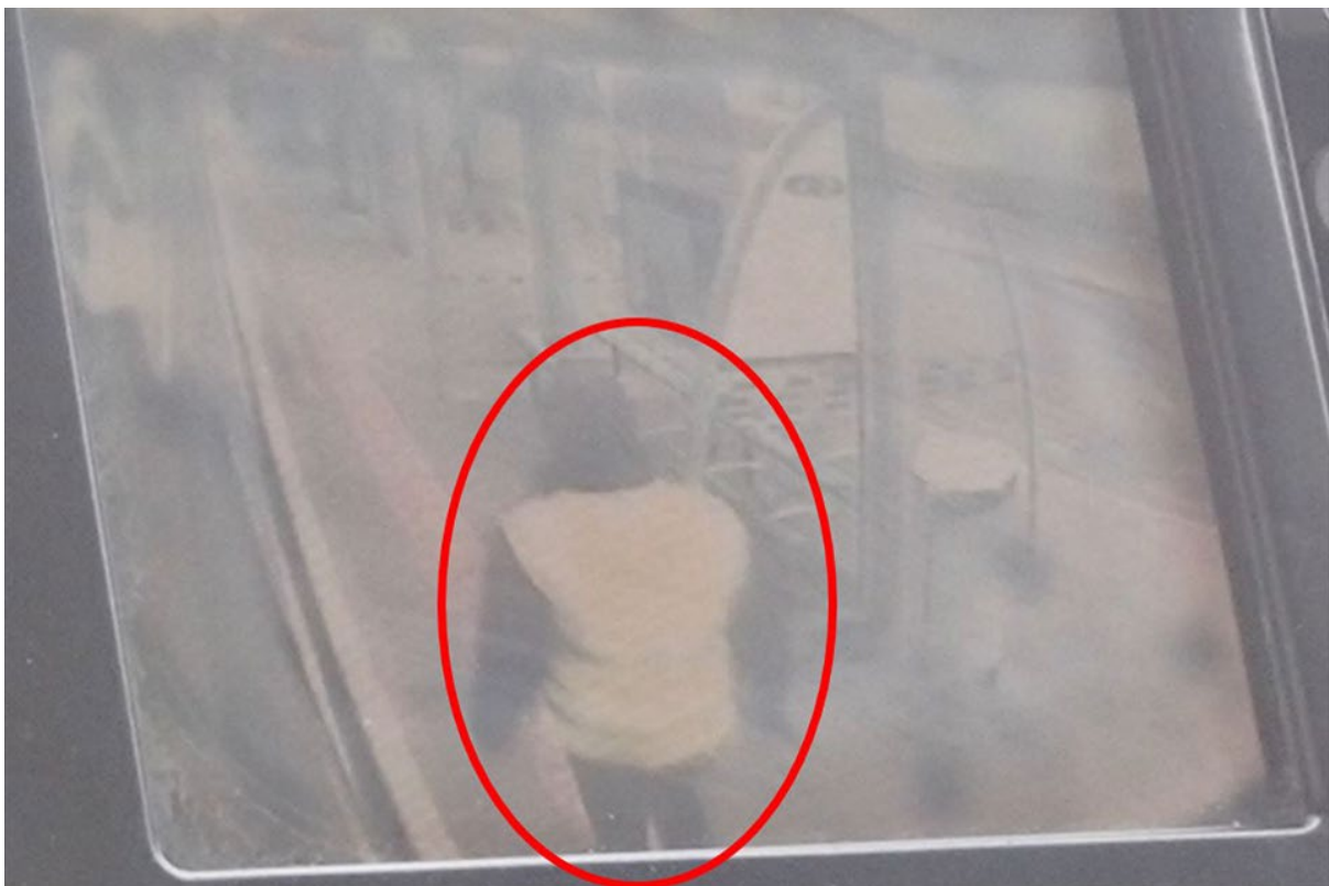
Rear view image from RAIB reconstruction.