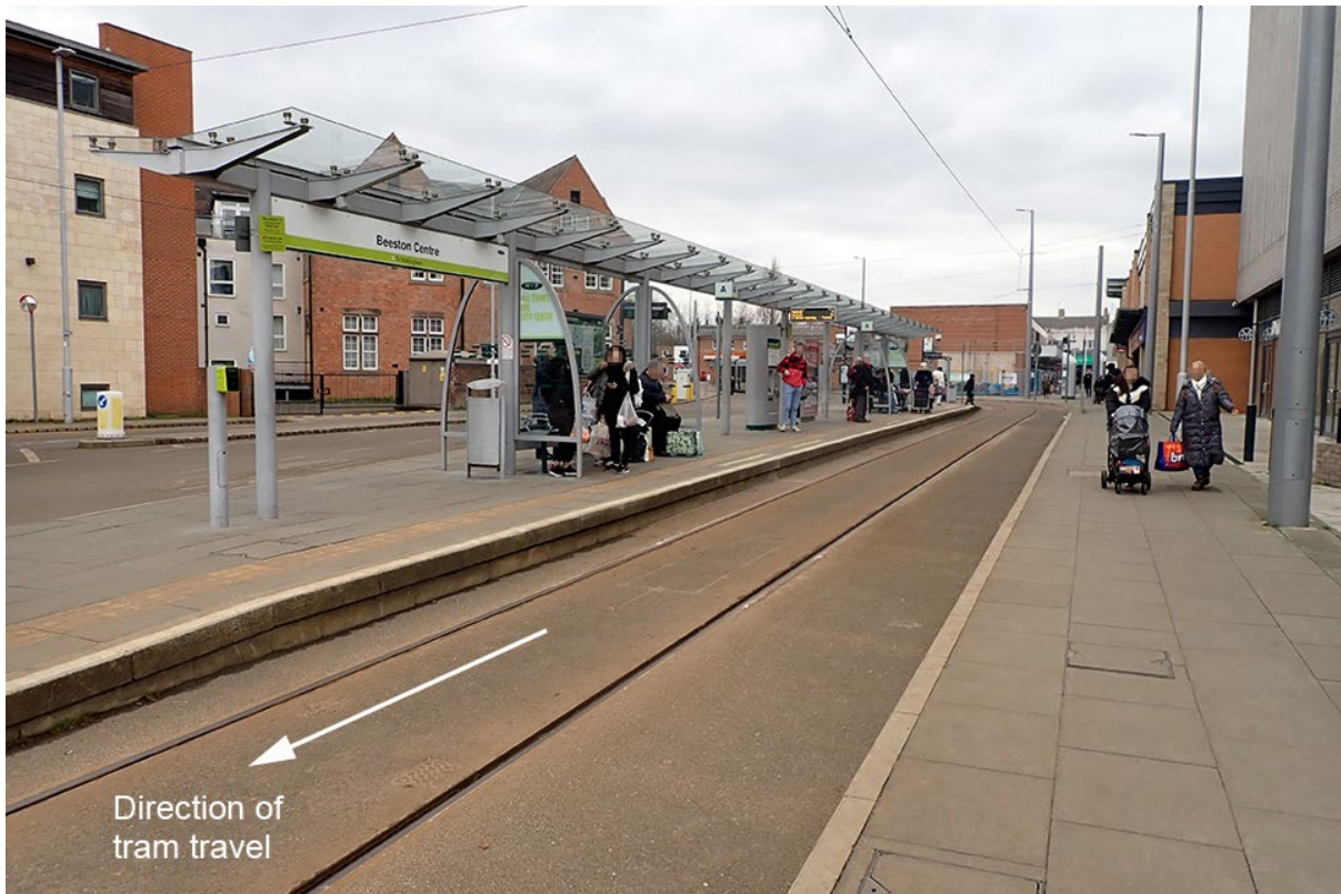
Beeston Centre tram stop.