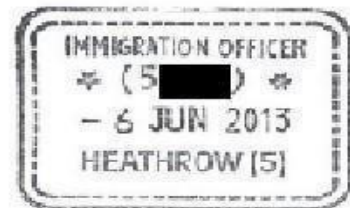
Immigration Officer's Date Stamp

In a small number of cases, when the Schemes went live, a Code 1A was not available, in place of this a Code 1 was used with the "no recourse to public funds" scored out in ink and possibly initialed by the Officer.