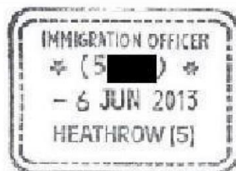
Immigration Officer's Date Stamp

Similarly, a Code1/Code 1A may have been endorsed in Ukrainian passports, if those individuals had entry stamps to Ireland from 25 February 2022. The stamps were manually amended from 'Leave to enter' to 'Leave to remain' possibly with the Officer's initials.