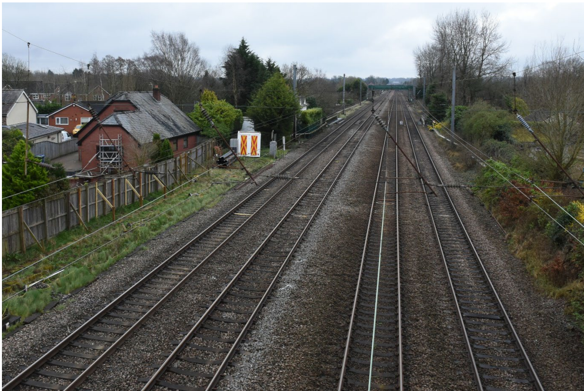
Photograph taken from Oak Avenue footbridge, looking towards the south. Railway lines, from left to right, are Up Fast, Down Fast, Up Slow and Down Slow. Old School Lane access point is to the left of centre behind the white cabin.