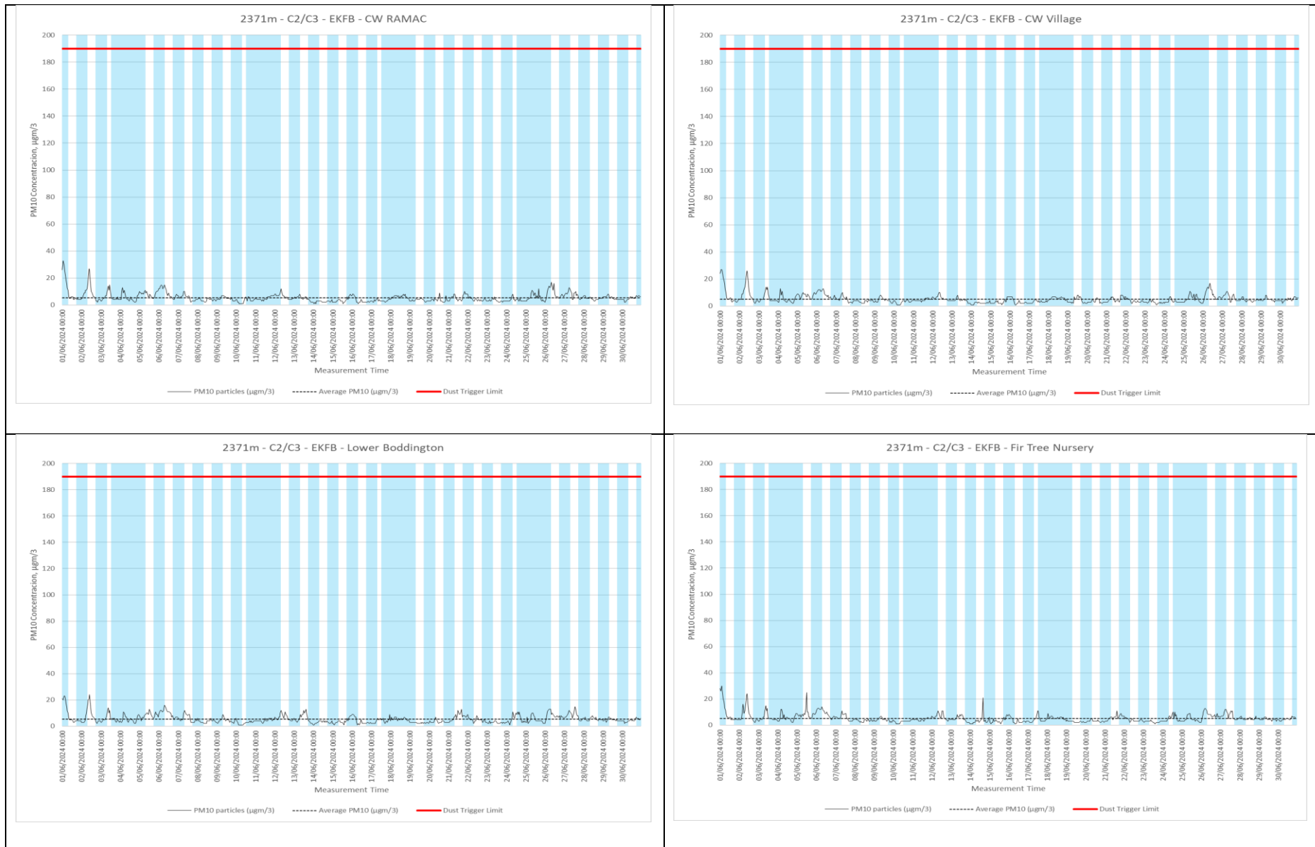
Figure 3: Continuous dust 1-hour mean indicative PM 10 concentration for all monitors