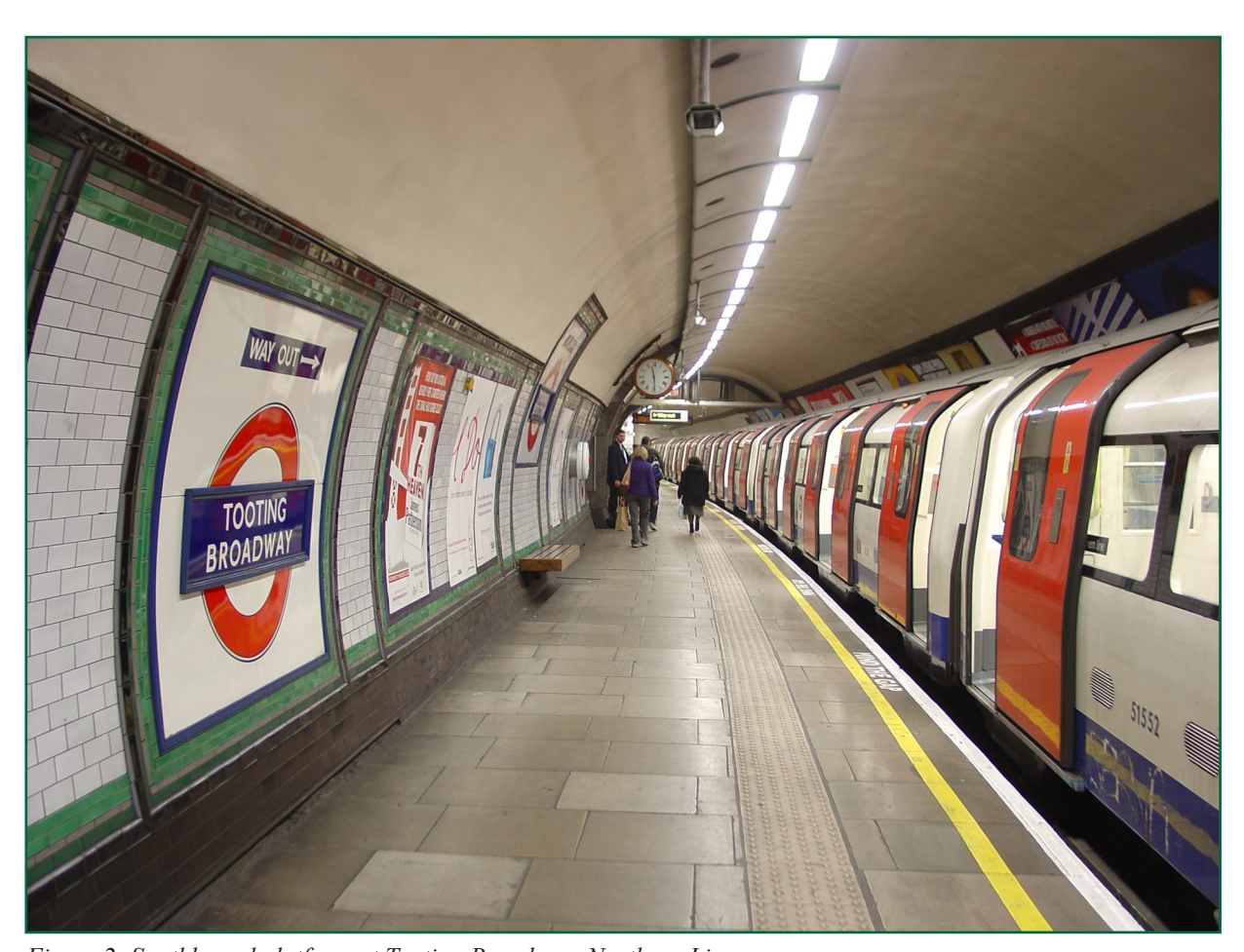
{\it Figure~2: Southbound~plat form~at~Tooting~Broadway,~Northern~Line}