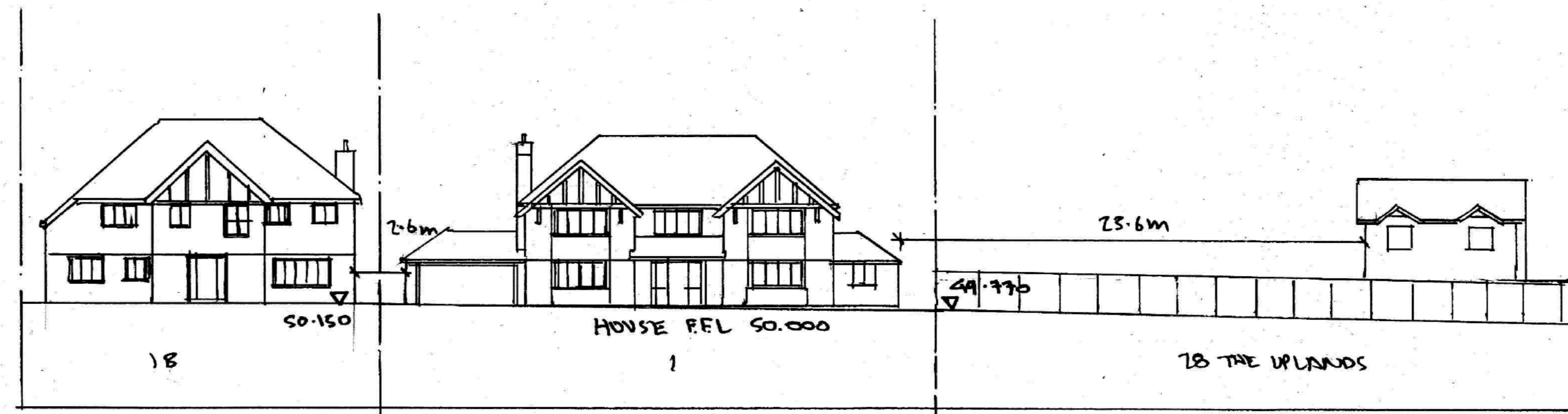
STREET SCENE PROPOSED