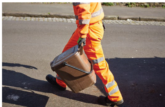
Table 1 Types of waste and recycling container

Table 1 details the size and volume of the waste and recycling containers issued to houses and buildings with up to six flats.