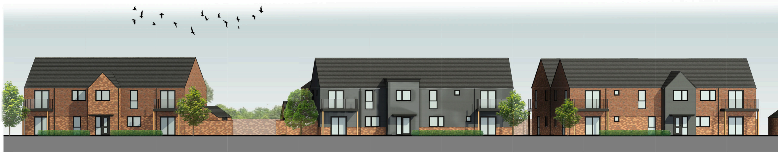
Section C-C 1 : 200

NOTE: NO DIMENSIONS TO BE SCALED FOR CONSTRUCTION. DRAWING MAY BE SCALED FOR PLANNING PURPOSES ONLY. ALL DIMENSIONS TO BE CHECKED ON SITE. COPYRIGHT RESERVED.