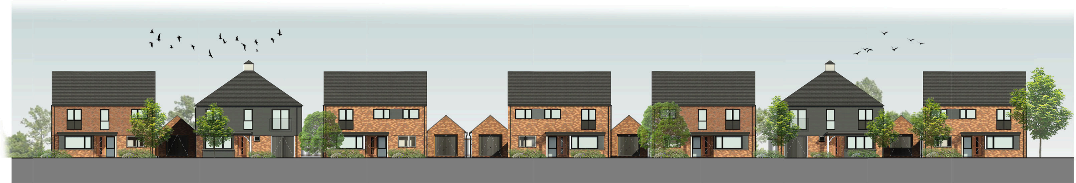
Section B-B 1 : 200