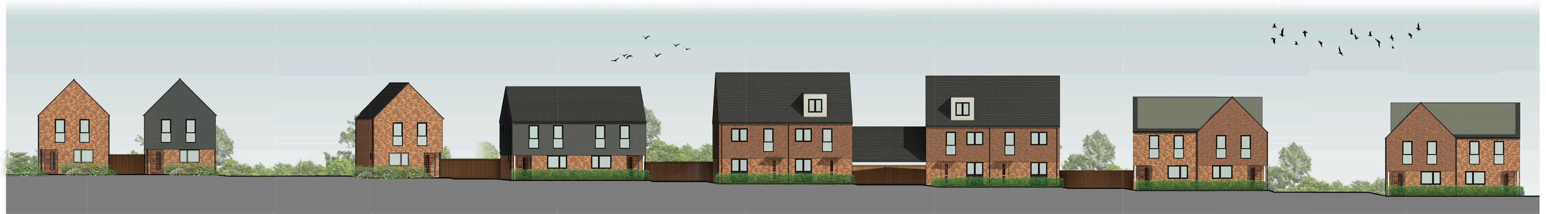
Section A-A 1 : 200

NOTE: NO DIMENSIONS TO BE SCALED FOR CONSTRUCTION. DRAWINGS MAY BE SCALED FOR PLANNING PURPOSES ONLY. ALL DIMENSIONS TO BE CHECKED ON SITE. COPYRIGHT RESERVED.