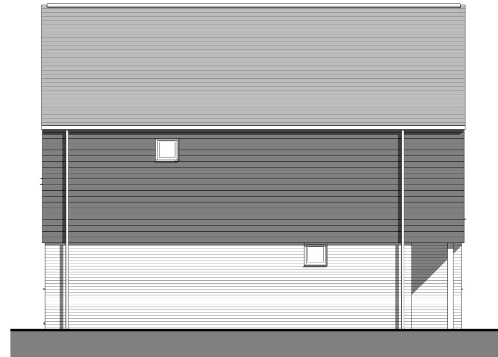
Side Elevation 1 : 100