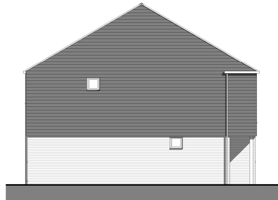
Side Elevation 1 : 100