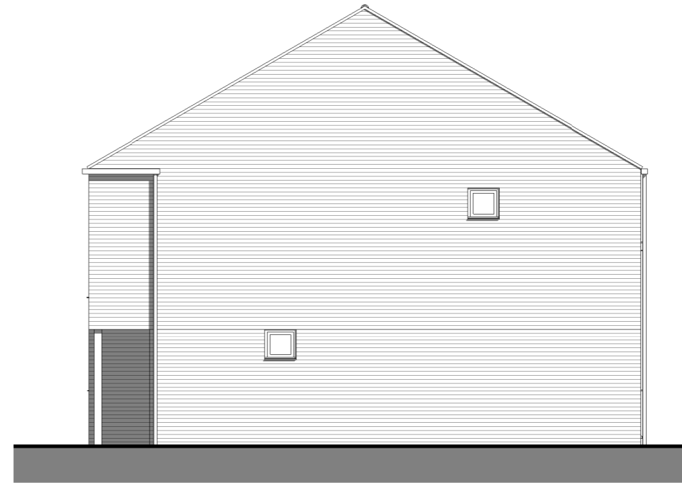
Side Elevation 1 : 100