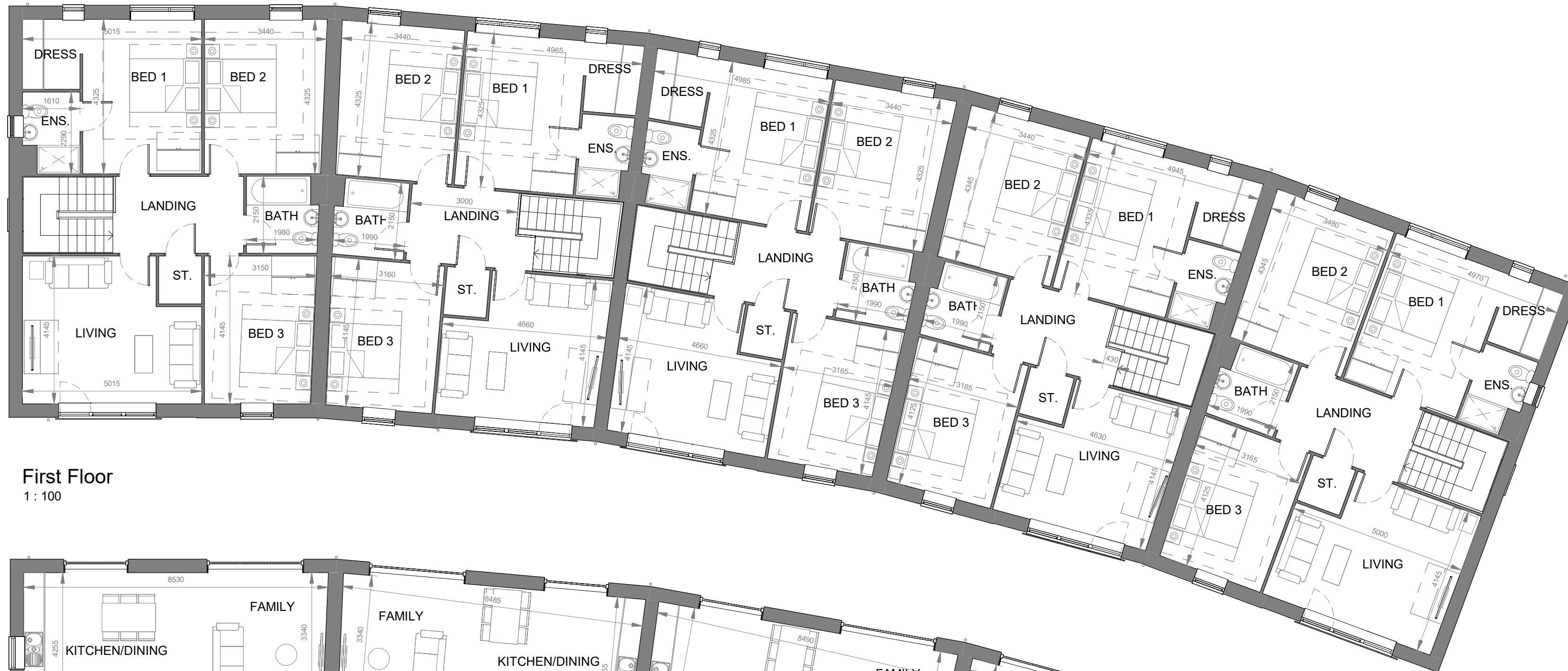
First Floor 1 : 100