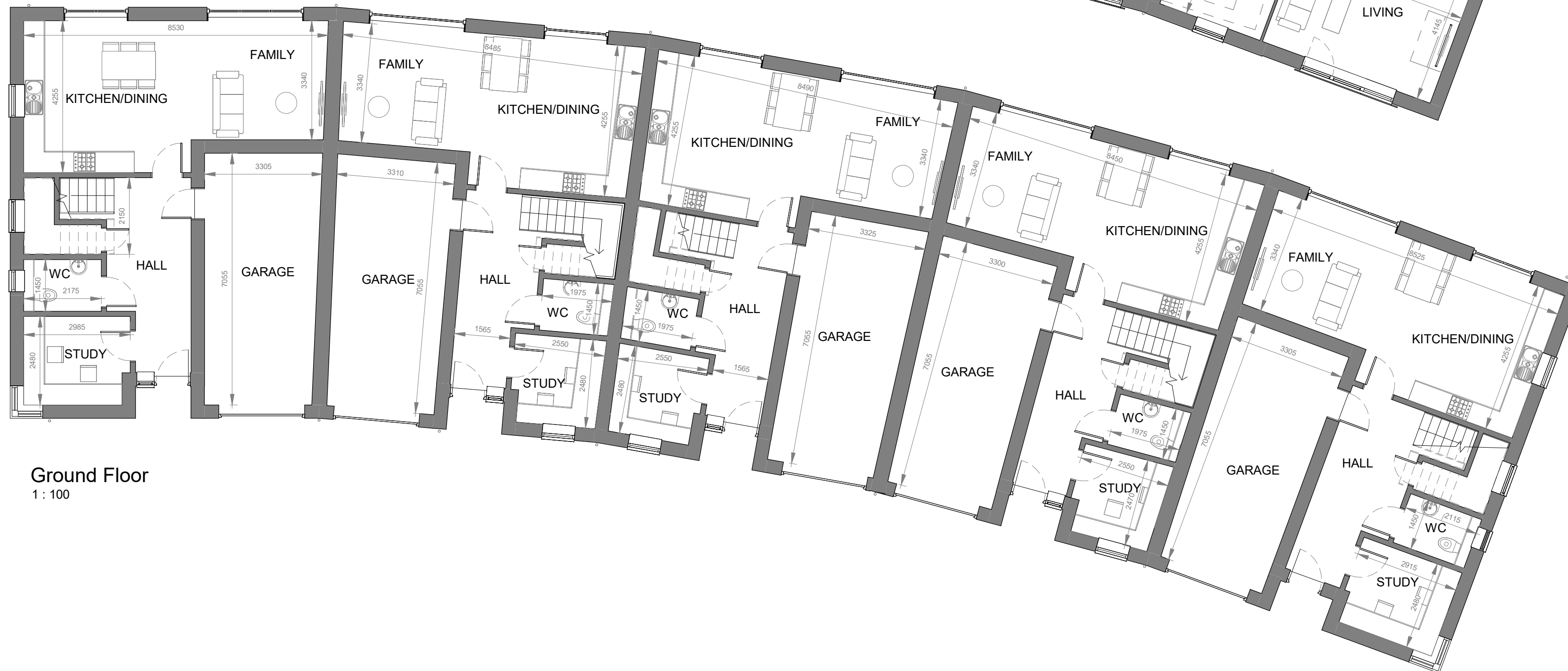
Ground Floor 1 : 100