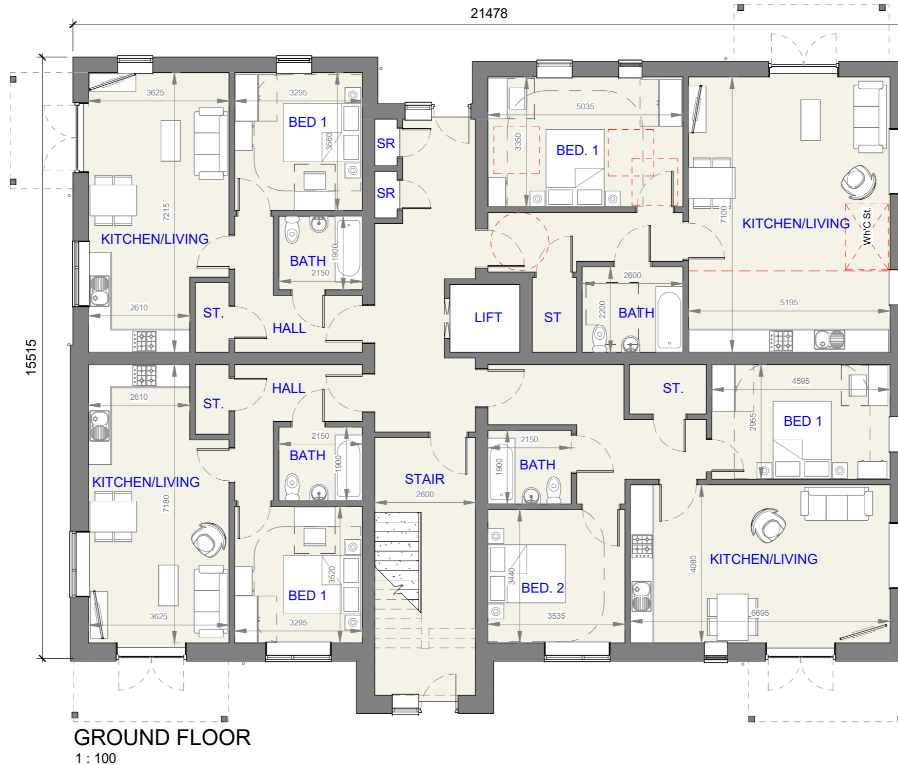
GROUND FLOOR 1 : 100