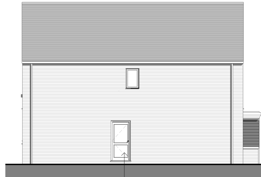
Side Elevation 1 : 100 Utility door to Plot 15 only