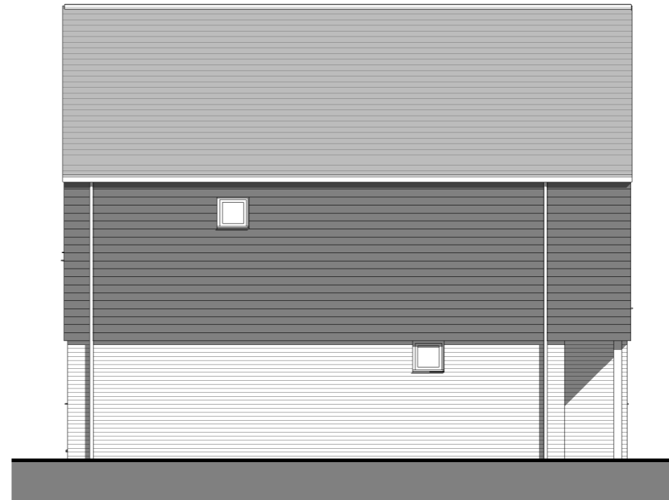
Side Elevation 1 : 100