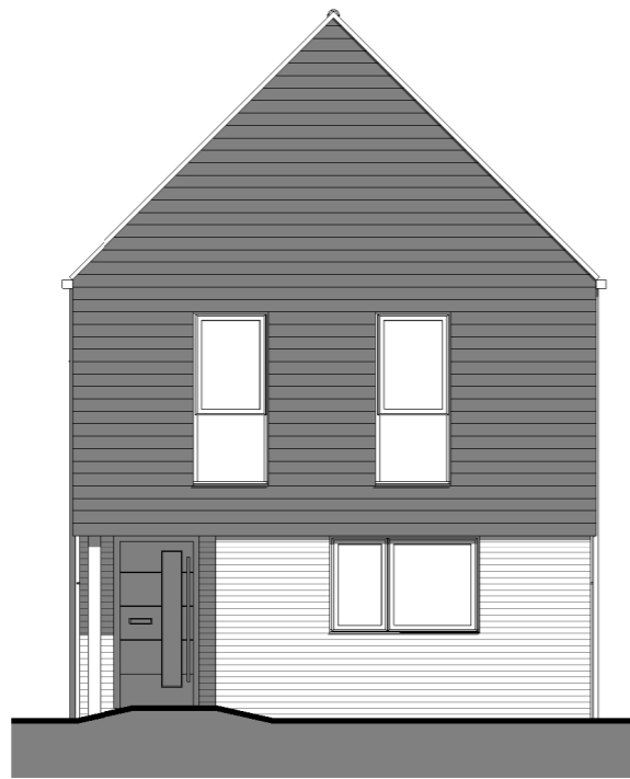
Front Elevation 1 : 100