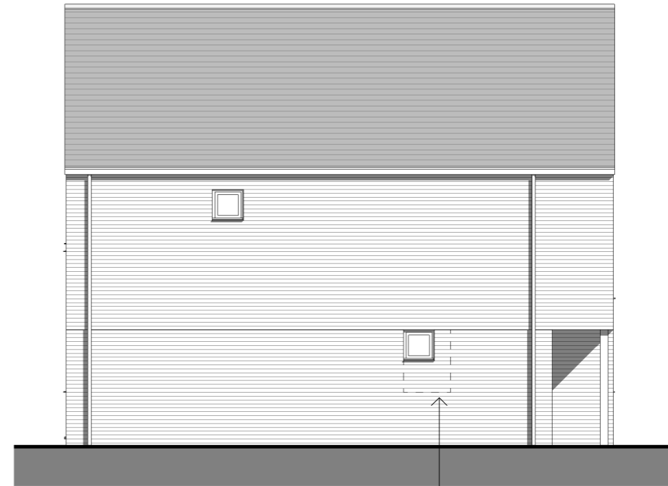
Side Elevation 1 : 100