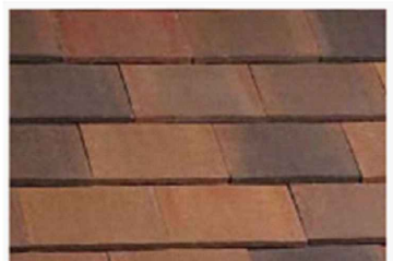
M5 - Roof tiles