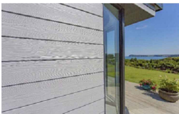
M4 - Cladding to feature elements