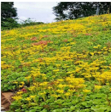
M7 - Green roof to the clubhouse