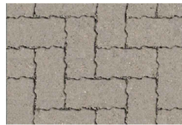
M15 - Permeable block paving to parking bays and driveways