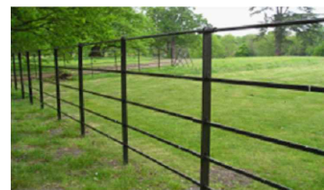
M18 - Estate railings around the cricket pitch