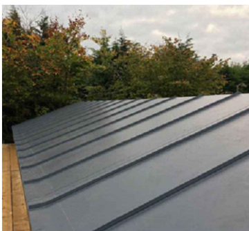
M8 - Sheet roofing to the clubhouse and flat roofed garages