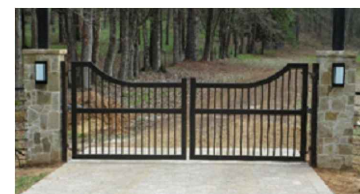
M19 - Black metal gates to the Mount Pleasant shared driveway