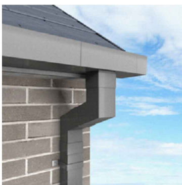
M11 - Black rainwater goods