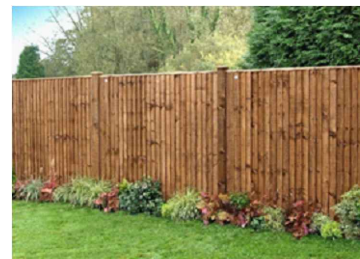
M17 - Timber fencing to the shared rear garden boundaries