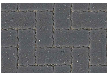
M14 - Permeable block paving to delineate parking bays