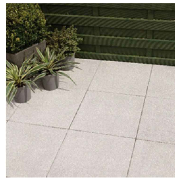
M16 - Concrete paving to private pathways and patio areas