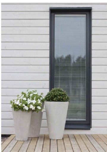
M10 - Grey colour coated windows