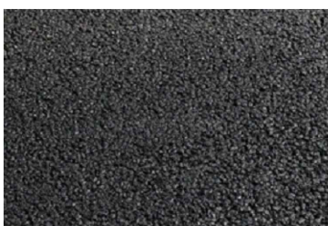
M12 - Permeable blacktop to principal roads