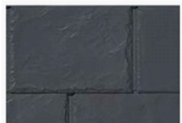
M6 - Roof slates