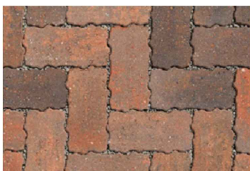
M13 - Permeable block paving to shared surfaces