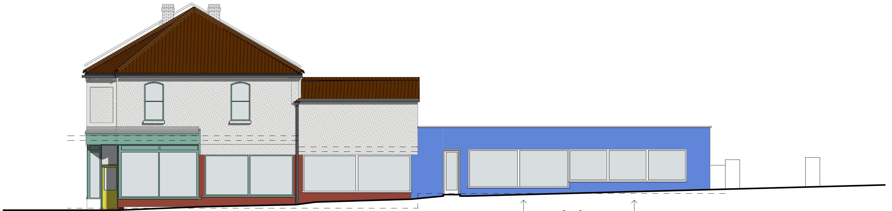
Existing Side A Elevation

Floor level to primary first floor area Floor level to first floor rear extension