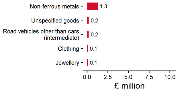
The top 5 UK goods imports, in the four quarters to the end of Q1 2024, from Armenia