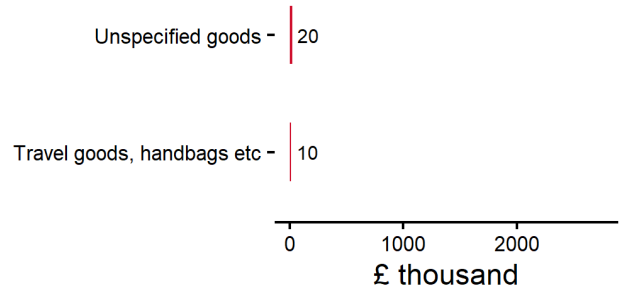
The top 2 UK goods imports, in the four quarters to the end of Q1 2024, from Bhutan