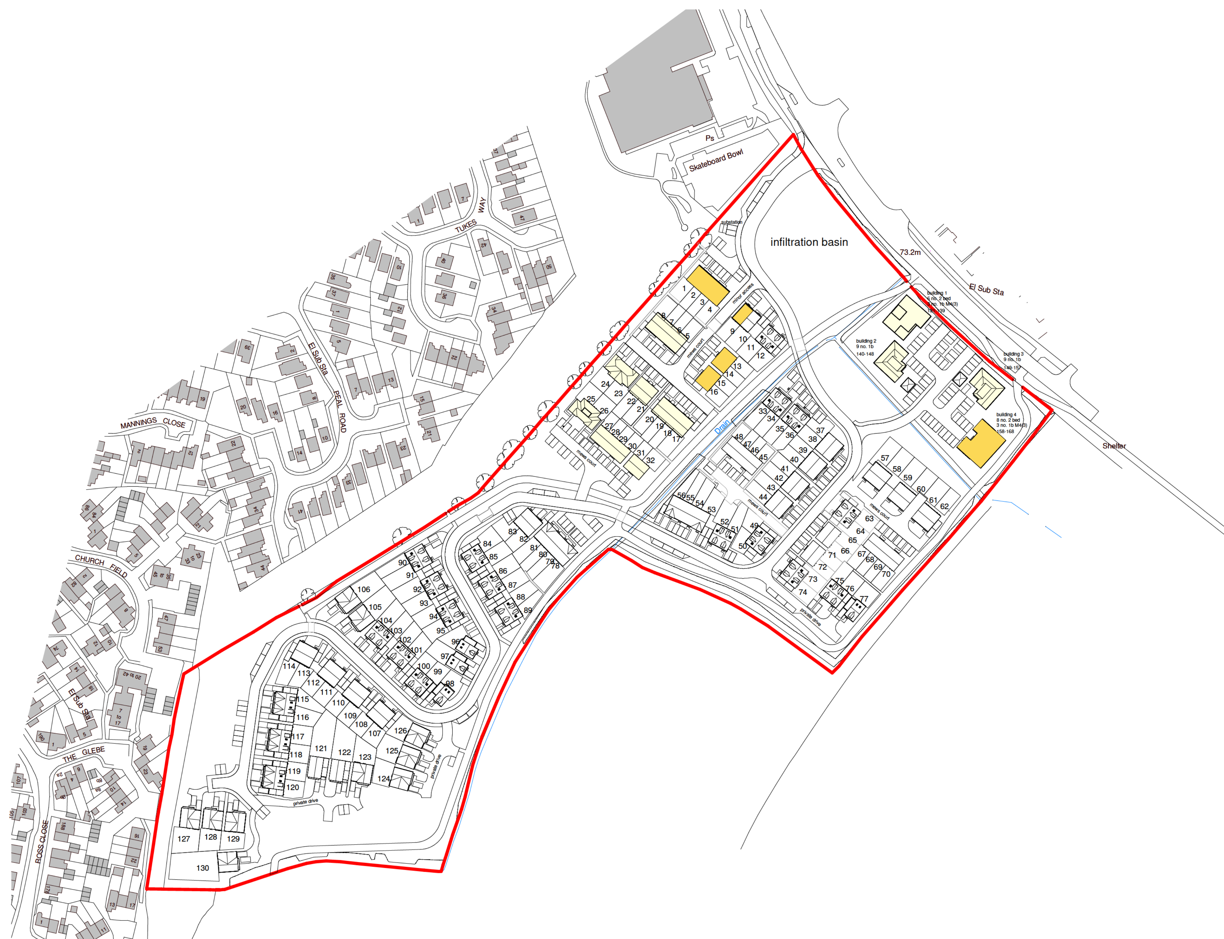
Site tenure plan-HA locations 1 : 1250

6% of Affordable Dwellings will be delivered as M4(3) compliant