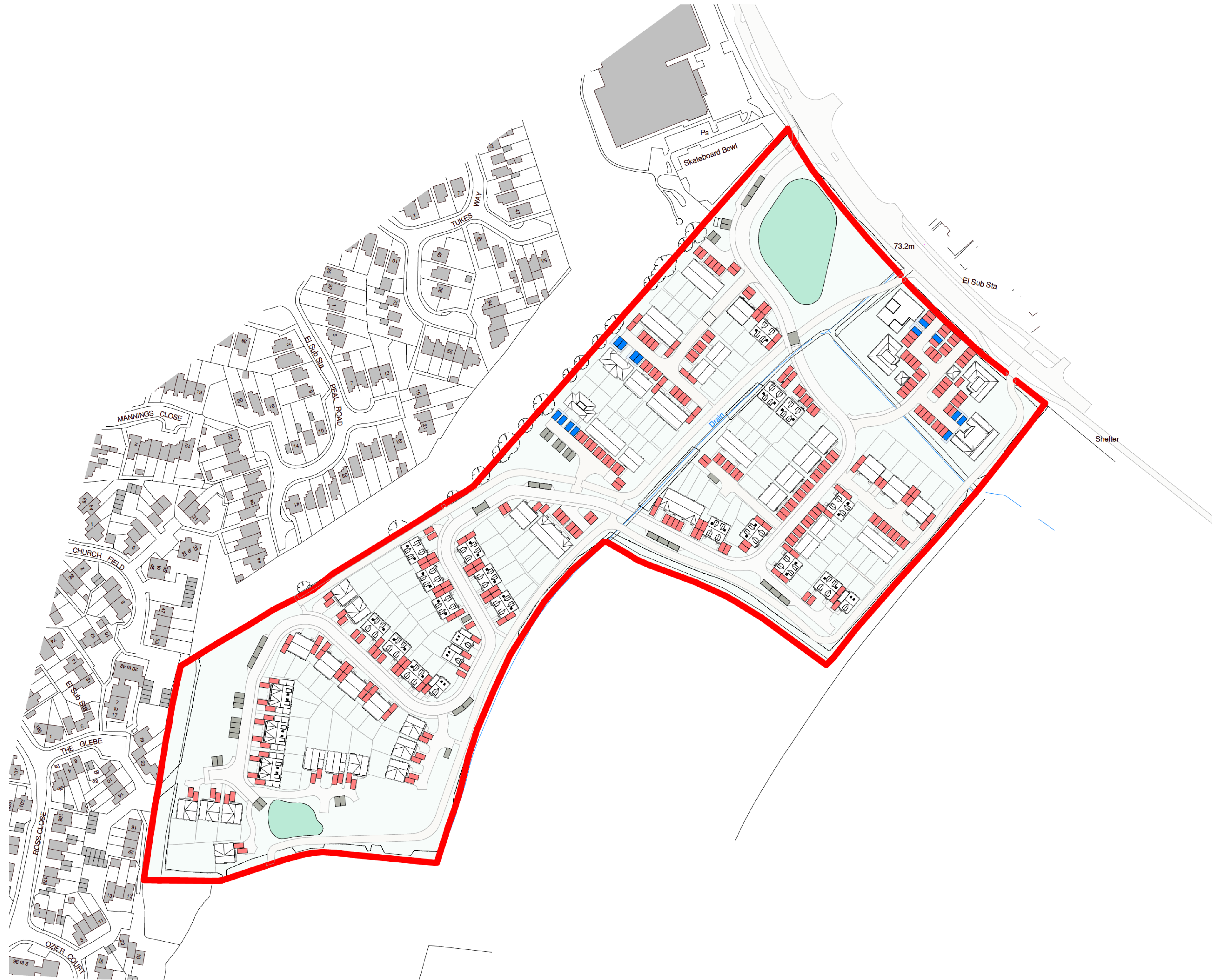
Site layout-Parking plan 1 : 1250