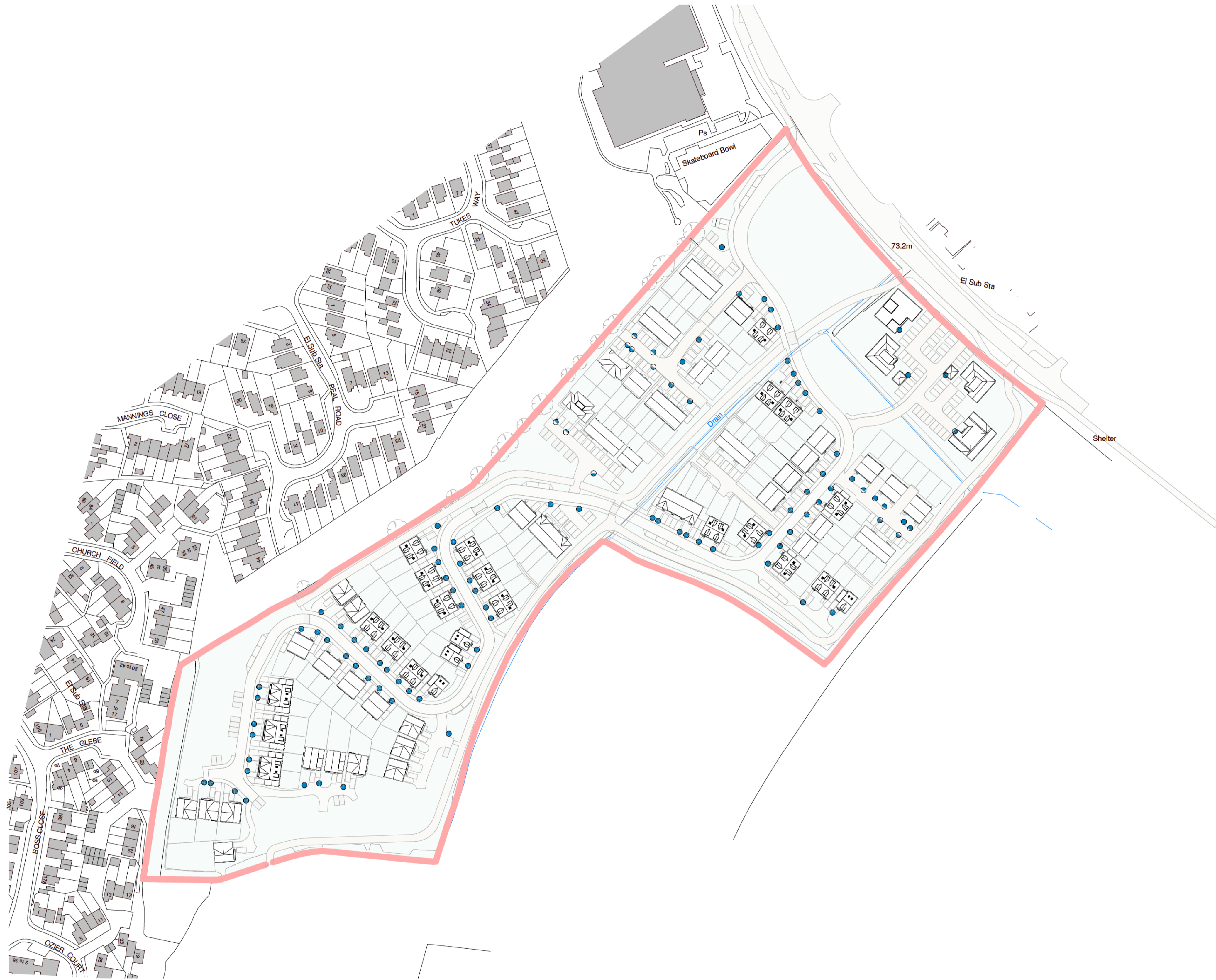
Site layout-Refuse strategy 1 : 1250