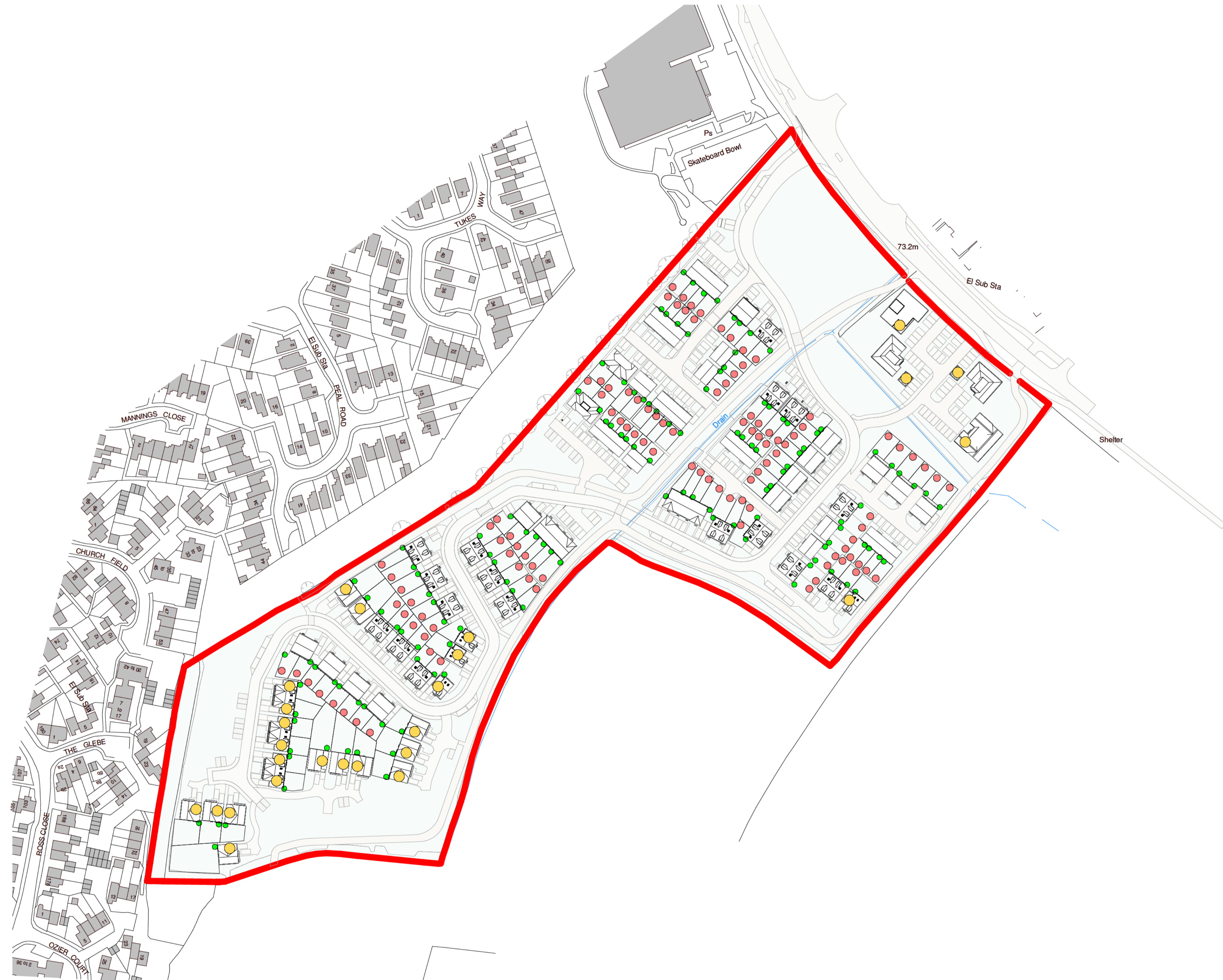
Site layout-cycle storage 1 : 1250