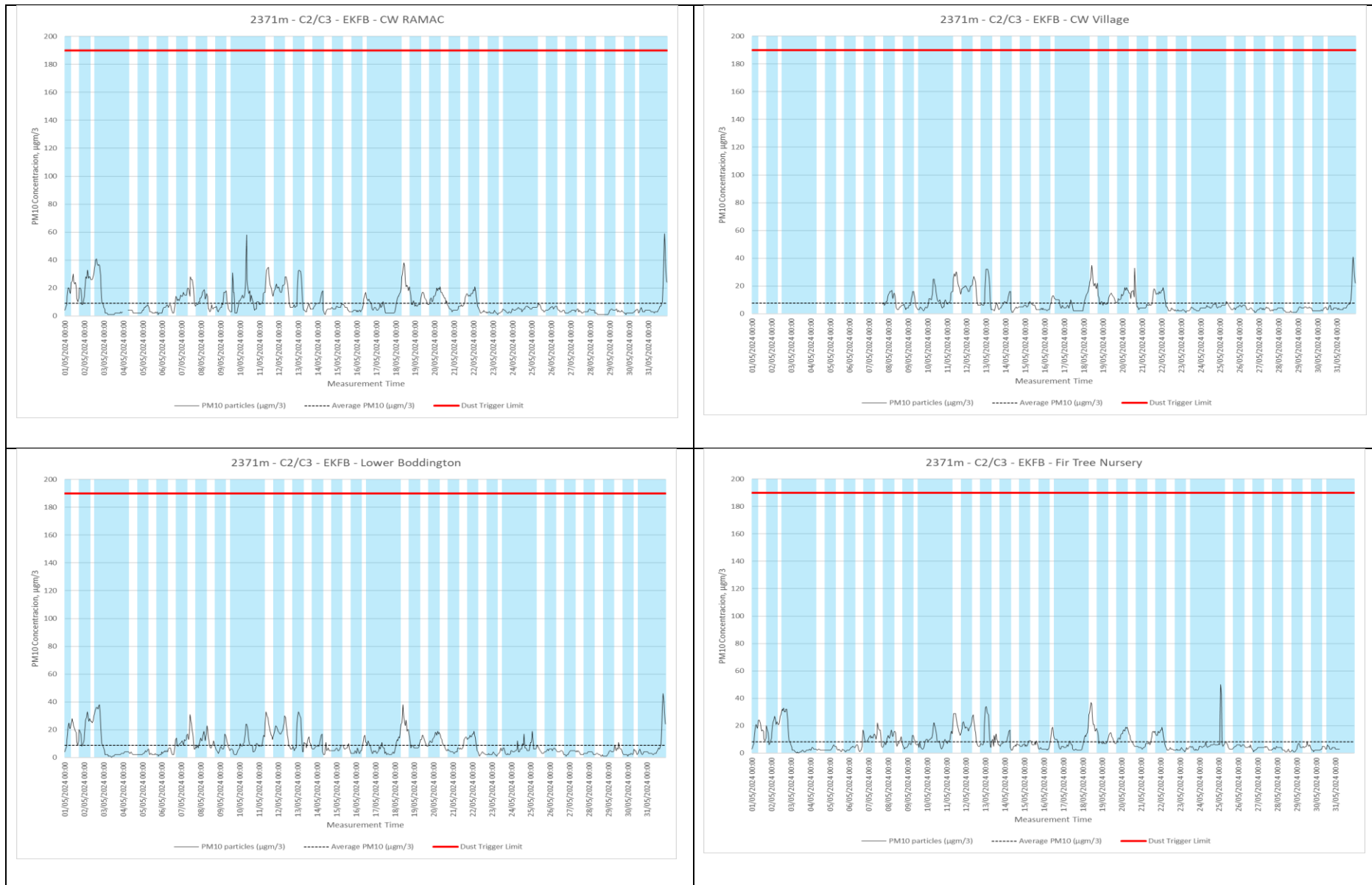
Figure 3: Continuous dust 1-hour mean indicative PM 10 concentration for all monitors