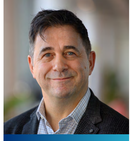
Juergen Maier CBE, FRS, FREng Chair

If we can combine the power of the private sector and government, we can accelerate the clean energy transition. And we can deliver stronger energy security, lower emissions and a boom in good green jobs across the country.