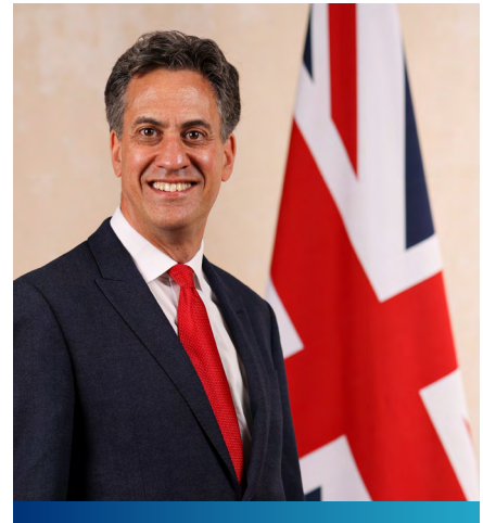
Ed Miliband Secretary of State

Other countries have also grasped the opportunities of investing in clean energy, but Britain is being left behind. We have tremendous advantages: from our long coastlines and shallow waters to our skilled energy workforce, with deep experience in offshore industries and cutting-edge technologies. The only thing that's missing is a long-term plan to harness these significant assets.