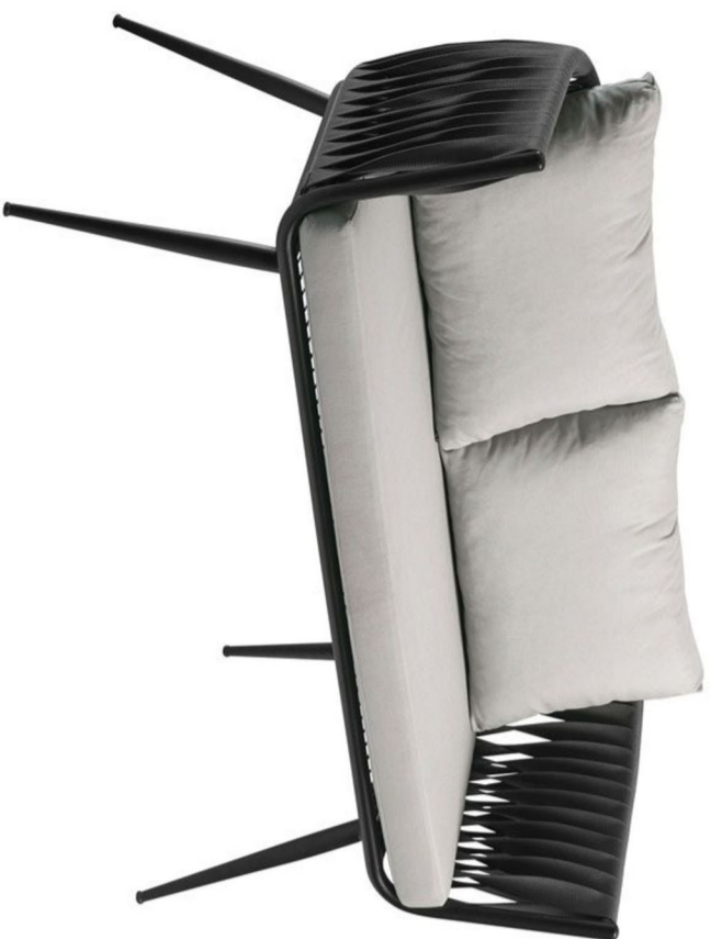
Two seater sofa