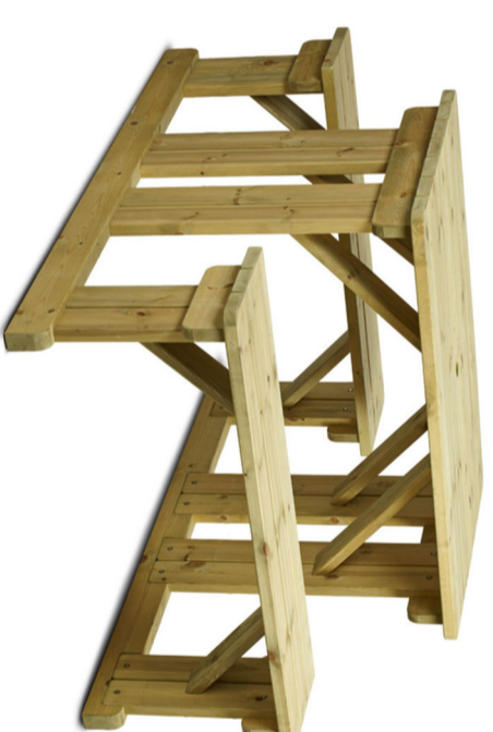
Six Person Bench