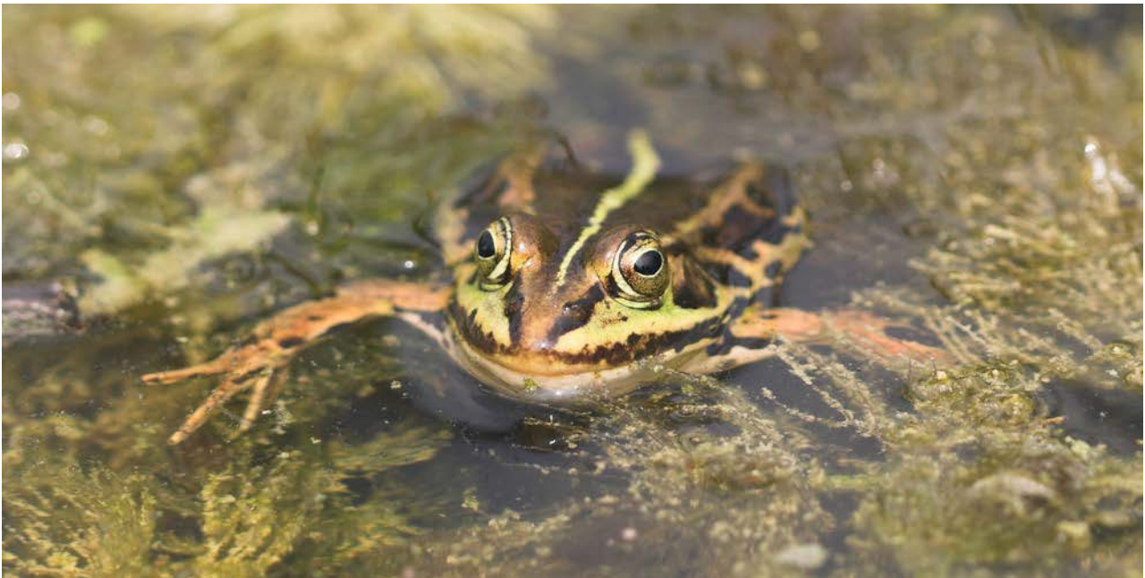
Pool frog. Photo credit: Allan Drewitt. Used under Creative Commons .