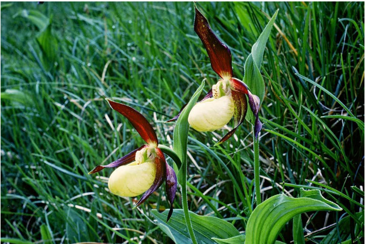
Lady's slipper orchid. Photo credit: Peter Wakely on Flickr. Used under Creative Commons .