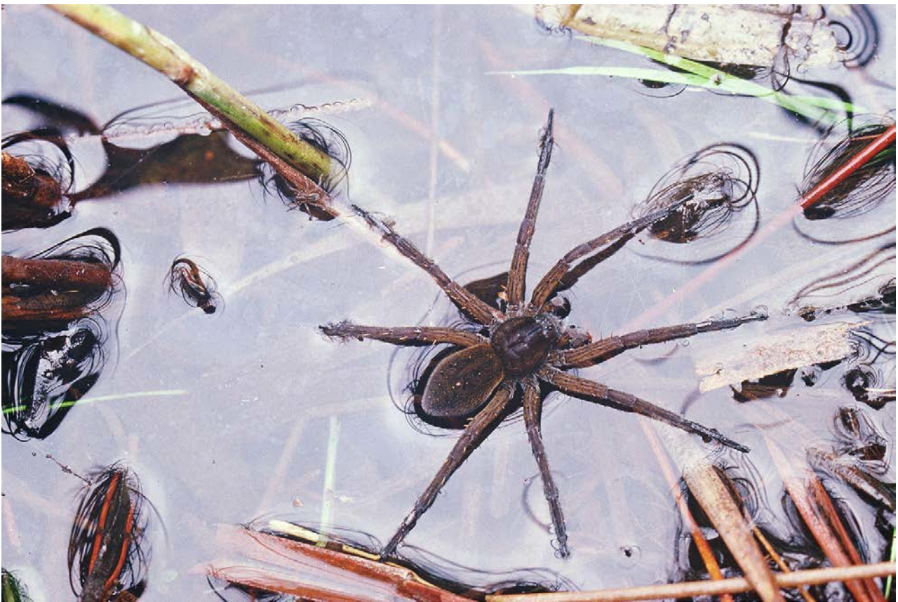
Fen raft spider. Photo credit: Peter Wakely on Flickr. Used under Creative Commons .