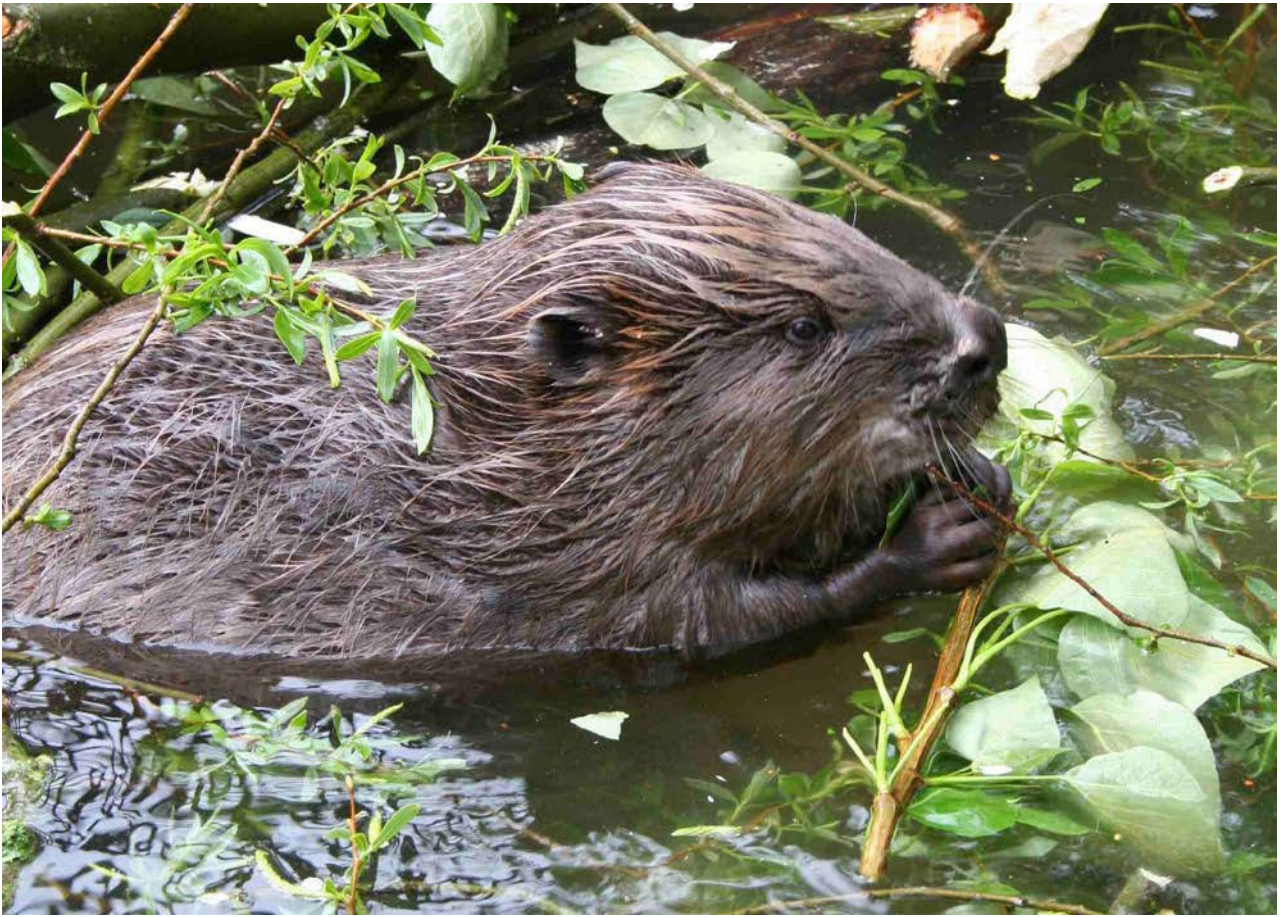
Eurasian beaver. Photo credit: Elaine Gill. Used under Creative Commons .