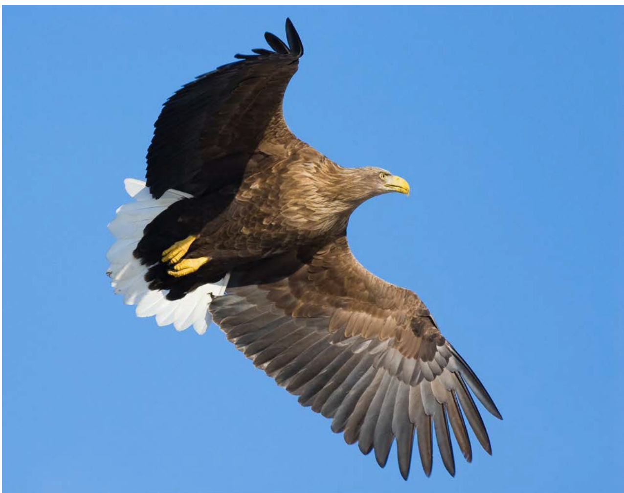
White-tailed eagle.

It is important to consider the mobility of species and their capacity to disperse or colonise. This will help you decide whether it is appropriate to consult on any translocation proposal close to a border.