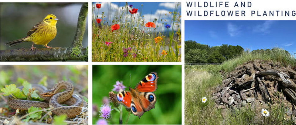
WILDLIFE AND WILDFLOWER PLANTING