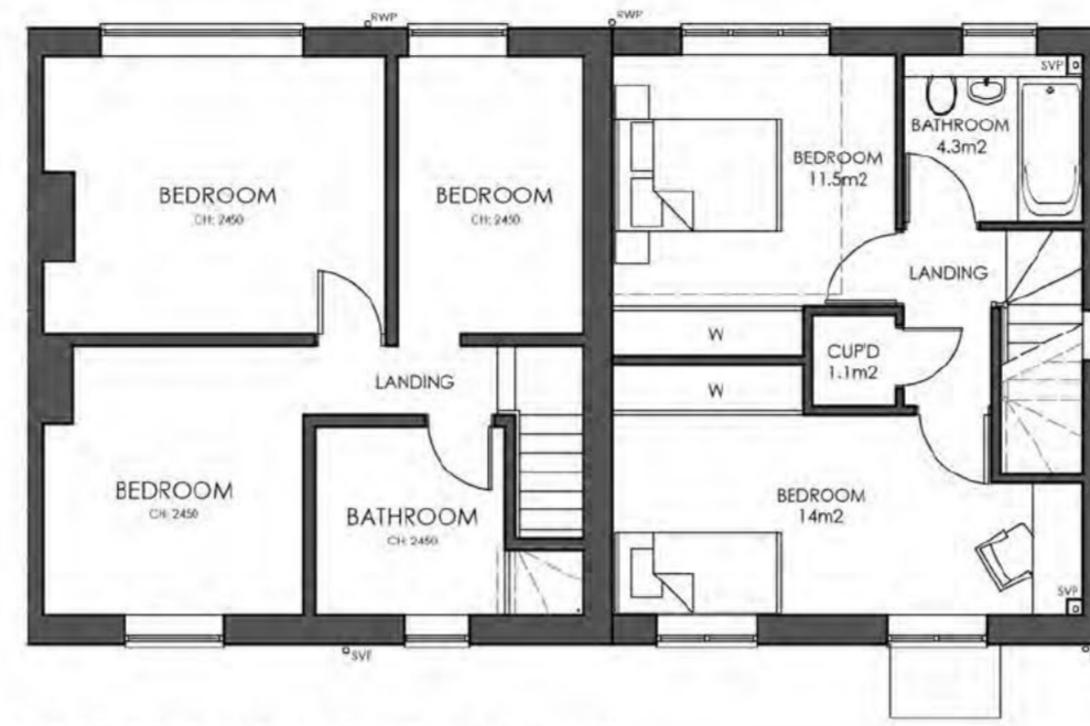
PROPOSED FIRST FLOOR PLAN 1:100 2 BED, 3 PERSONS: 75m 2