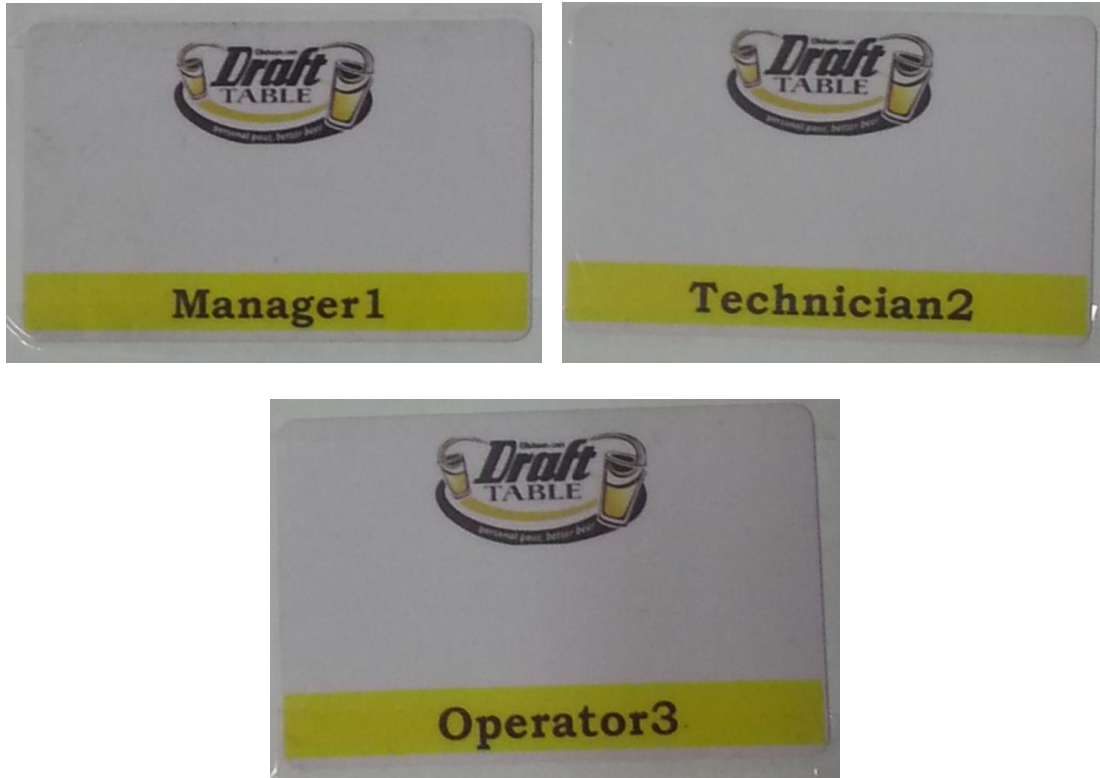
Figure 7 - Remote RF controller box authorisation cards