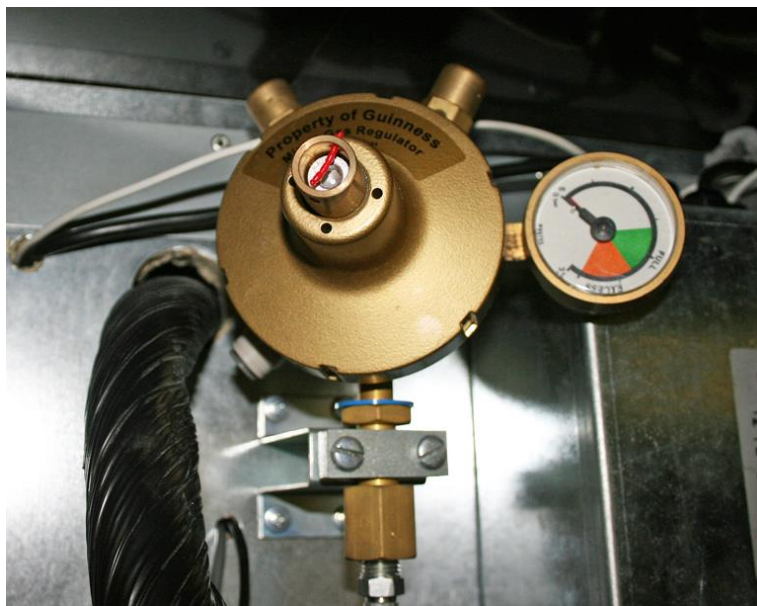
Figure 8 - Pressure gauge/regulator