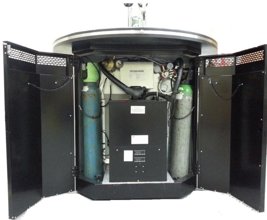
Figure 4 - Photographic back view of inside of cabinet "Dry Side"