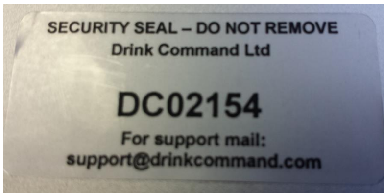
Figure 10 - "VOID" if removed labels