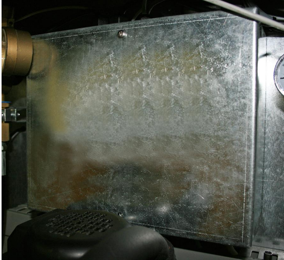
Figure 9 - Internal control box