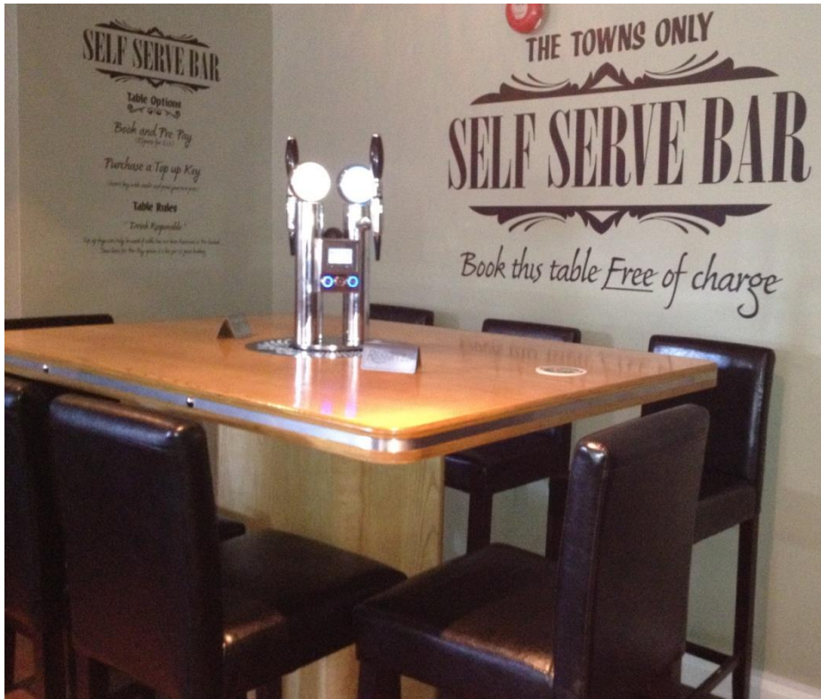
Figure 11 - Authorised alternative dual-font fixed system.