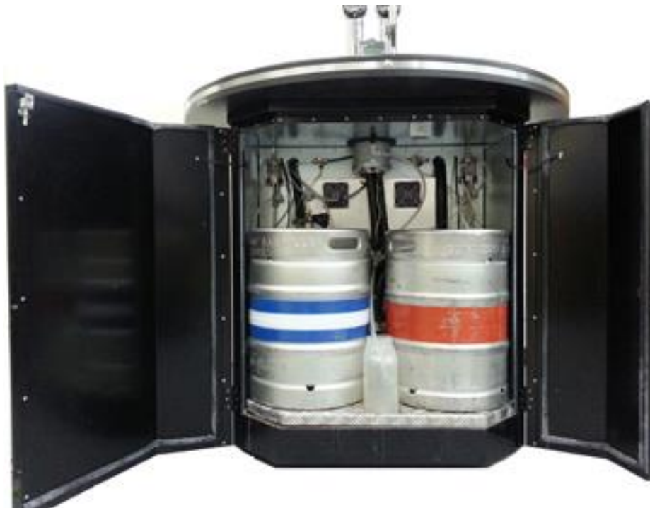
Figure 3 - Photographic front view of inside of cabinet "Wet Side"