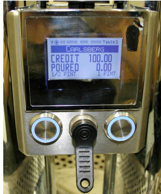
Figure 5 - Central column LCD, magnetic i-Button holder and touch sensitive activation buttons