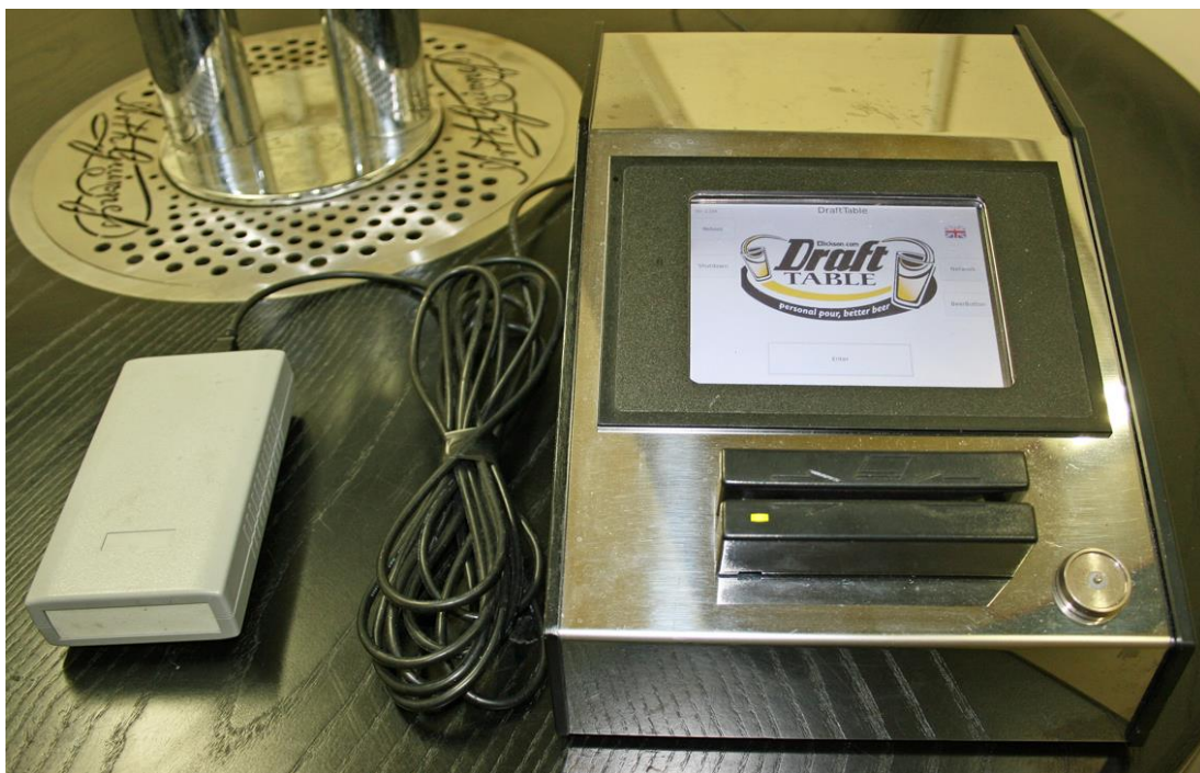
Figure 6 - Remote FR controller box with transceiver.