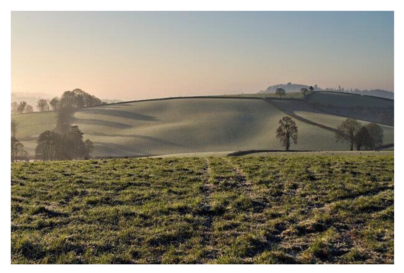
Check your land is eligible

This section contains mandatory scheme requirements.