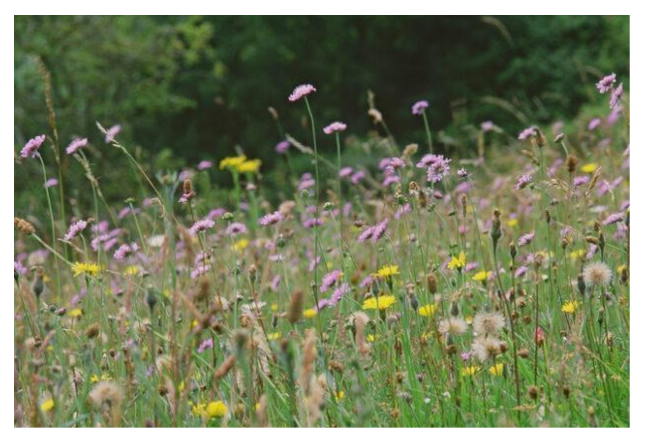
Create habitats to support an IPM approach