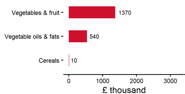
The top 3 UK goods imports, in the four quarters to the end of Q4 2023, from OPT