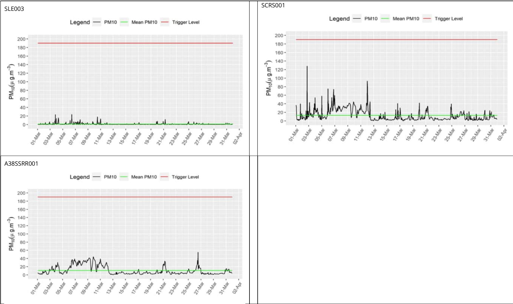
Figure 2: Construction dust 1-hour mean indicative PM 10 concentration for all dust monitors