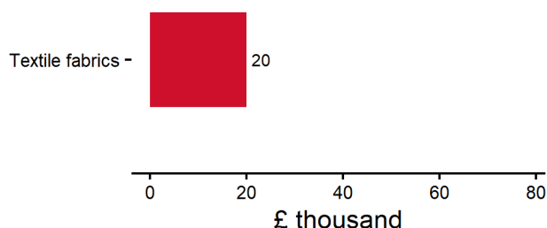
The top 1 UK goods imports, in the four quarters to the end of Q4 2023, from Tuvalu