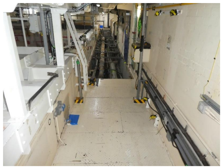
Photograph 3: Floor plates that cover the pond's trench

• Pond Pump Room Basement: progress continued with de-planting contaminated pipework and equipment.