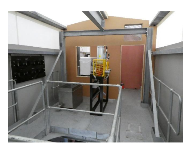
Photographs 22 - 25: Construction of the Vacuum Fill House

In parallel to this activity, the removal of redundant equipment within the waste buildings continued. This equipment included out-of-service ventilation ductwork which was both radiologically contaminated and contained asbestos. Collaborative working between the Health Physics department and the onsite licenced asbestos contractor enabled the safe and efficient removal of this equipment as shown in the photos below.