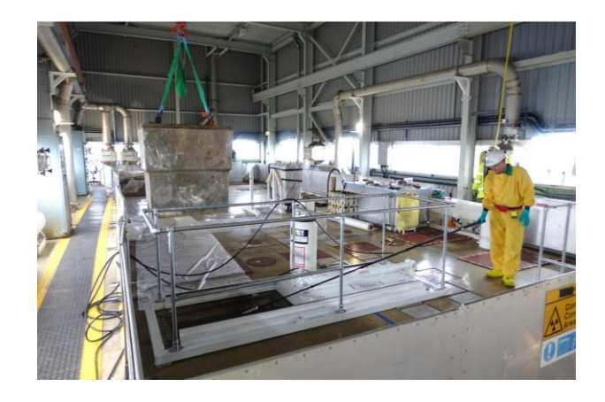
Photograph 29: Removal of Vault Plug following installation of new Shielded 'Gamma Gates'