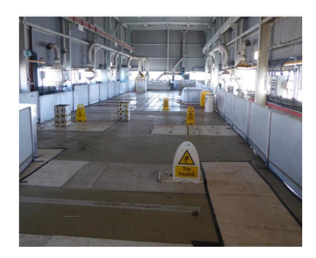
Photograph 28: Vault Top Prior to Installation of Retrievals Equipment

Manual sorting of the FED waste will be carried out using Over Wall Tools to remove fuel fragments and High Dose Rate Items. Samples will be taken for radiochemical analysis. The FED will be loaded into 210 litre drums. Five drums will be collected from each of the 5 vaults. The drums will be used for further analysis and hydrogen trials, where drums will be super compacted and hydrogen evolution measured.