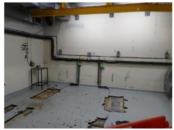
Photographs 26 - 27: Removal of redundant equipment within the waste buildings