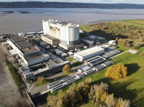
Photographs 9 - 10: Solar panels installed on portacabins and Construction Office (note: fences have been removed for security purposes)