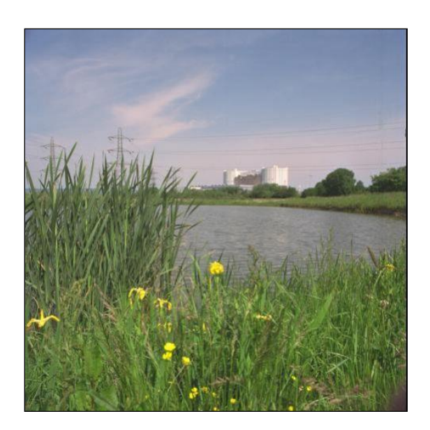
Photograph 1: Oldbury Site Viewed from the Nature Trail

Other buildings and plant associated with operation of the site include the cooling water pump house, the national grid substation (now removed), workshops, stores and offices.