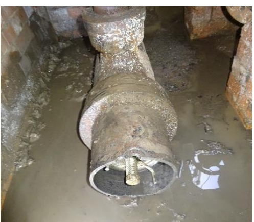
Photographs 12 – 17: Mechanical isolations in the Turbine Hall