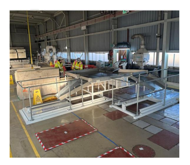
Photograph 30: Installation of FED Sorting Table and Waste Chute