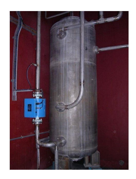
Photograph 6: One of three Caesium Removal Units in the PFP building