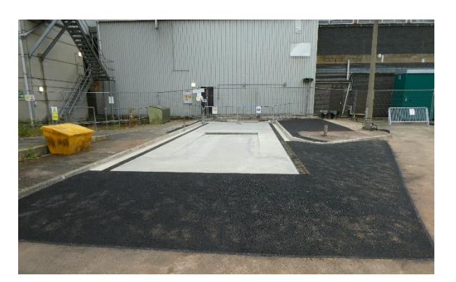
Photographs 18 - 21: Foundation preparation for the Vacuum Fill House

With the foundations completed in July, the next phase of the projects was to begin the installation of the new vacuum retrieval equipment. This equipment aims to draw wet Intermediate Level Waste out of existing tanks and transfer it into safe long-term storage containers.