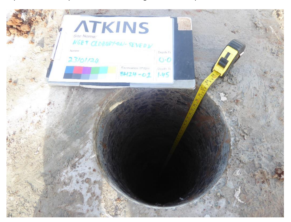
Photograph 11: Borehole drilled for substation lease handover

The final activity required before the National Grid / NRS lease can be surrendered was a ground contamination survey to prove the ground is free from any remaining hazards. This is now complete with all results coming back negative for any contamination. The area will now be handed over to the Waste Department who plan to use it a storage area for skips and containers.