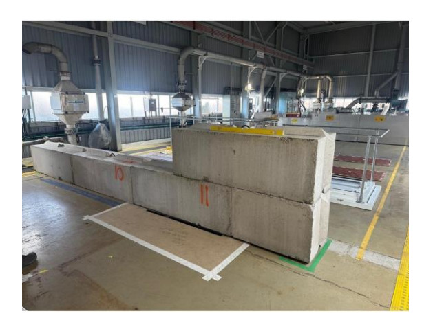
Photograph 31: Construction of the Shield Wall to Protect Operators from Dose