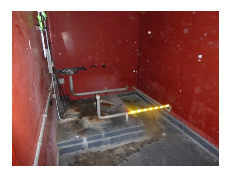
Photograph 8: A Caesium Removal Unit de-planted from one of the three CRU Cells from within the PFP building

Looking ahead, the focus for 2024/25 will be on decommissioning the Settling Tank Resin (STR).