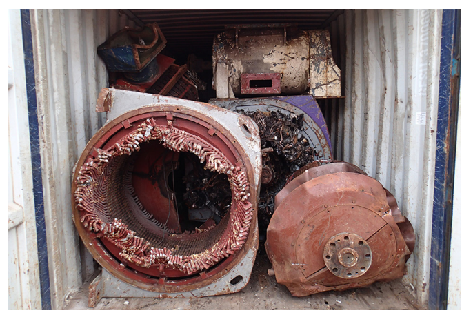
An example of asymmetric loading of heavy scrap electrical machinery.

settle and can remain offset. It is important that loading is done in a way that ensures as far as possible that the load is evenly distributed and centred. Following a derailment at Angerstein Junction in 2014 (report 11/2015), RAIB's investigation found that a mineral load (crushed rock fines) had adhered to the interior of a wagon (from which the load was supposed to have been discharged) in a way that created significantly uneven wheel loads. Heavy, discrete items, such as electrical machines, may be presented for rail transport loaded in sealed containers, and so it is equally important that the position of the centre of gravity of the load is considered when the container is being packed. In our investigation of a derailment at Reading West Junction in 2012 (report 02/2013), we found that pallets loaded with automotive components, which had been placed along the centre line of a container, had moved to one side while the container was being transported by road, resulting in a significant lateral offset to the load when the container was placed on a rail wagon. We recommended that freight terminal operators should improve their arrangements for both reducing the likelihood that inadequately packed containers are presented for rail transport, and for detecting asymmetric loads when containers are being handled before loading.