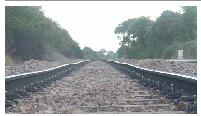
An example of poor track geometry which resulted in derailment of a freight train.

The geometry of the track, in terms of its vertical alignment ('top'), horizontal alignment ('line'), the change in relative height of the two rails ('twist'), and the distance between the rails ('gauge'), must be maintained to suitable standards to prevent derailments. Other factors, including rail wear and railhead condition, can also be among the causes of accidents. Many RAIB investigations have identified deficiencies in maintenance which have led to derailments, either on their own or in combination with vehicle defects.