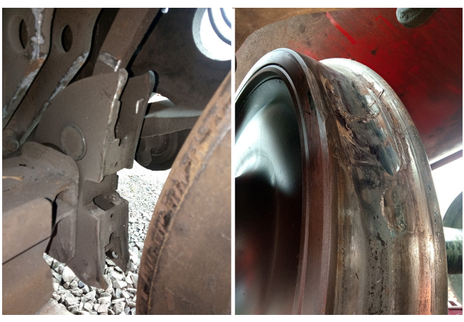
Missing components and damaged wheel treads following locking of a wagon brake mechanism.

A poor standard of maintenance was also found in our investigation into an accident at Carpenters Road North Junction, London, in 2019 (<u>safety digest 07/2019</u>), when components of a wagon's braking system fell off during the journey, and got under the wagon's wheels and derailed it.