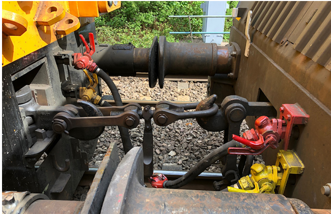
Positions of brake pipe valves on locomotive involved in the SPADs at Crofton.

The need for brake continuity tests to be the final duty undertaken before departure was further demonstrated in the incident at Crofton West Junction in 2020 ( safety digest 06/2020 ). In this incident, a freight train was prepared for departure, including a brake continuity test, during the evening before departure. However, after train preparation was completed, but before departure, a group of trainees and an instructor visited the sidings and used the train to practise train preparation procedures. This led to the brake pipe valves between the locomotive and the wagons being closed, rendering the air brakes on the wagons non-operational. This