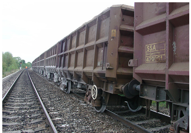
Wagons following derailment at Hatherley.

Being able to control the speed of a train is evidently vital for the safe operation of the railway. Normal practice on railways around the world is for the vehicles in a train to be equipped with power-operated brakes, which can be controlled by the driver and which will apply automatically to all parts of a train, should it become divided.