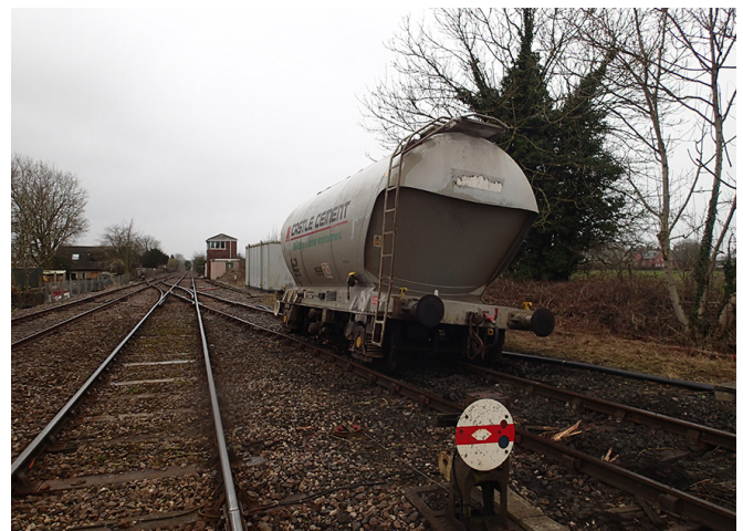
Derailed wagon following runaway at Clitheroe.

At Clitheroe in 2020 ( report 16/2020 ), a wagon ran away from a cement works and derailed on trap points when it reached the main line. The runaway occurred in part because the wagon's handbrake was providing insufficient brake force, most likely because the slack adjuster was not working correctly. The investigation found that a scheduled maintenance examination, which would probably have identified this defect, had not been carried out when it was due.