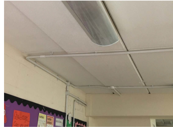
Figure 10: Example of deflected RAAC panel