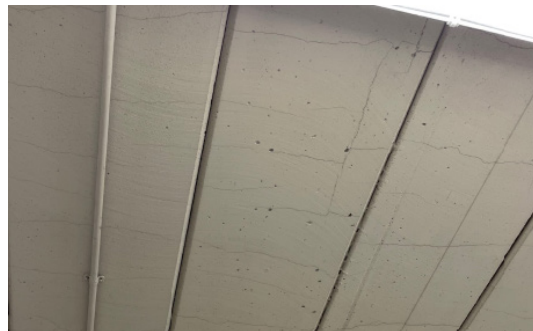
Figure 7: Underside of a cracked RAAC panel