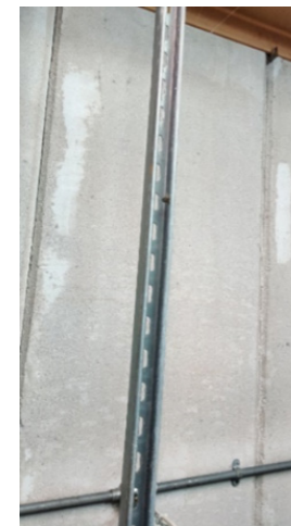
Figure 9: V-shaped grooves at 600mm spacing