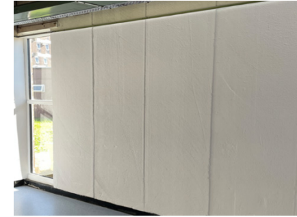
Figure 5: Example of RAAC to an internal wall face