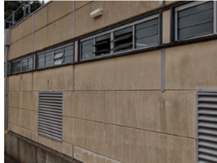
Figure 4: Example of RAAC in walls