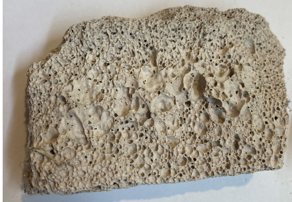
Figure 2: A fragment of RAAC showing its 'bubbly' appearance