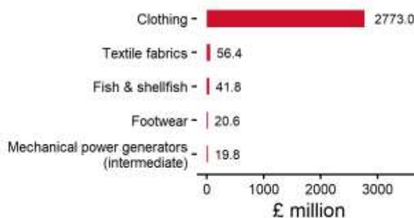
The top 5 UK goods imports, in the four quarters to the end of Q3 2023, from Bangladesh