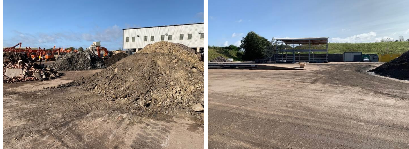
Received waste batches for sampling/testing.

The pad is used for the storage of received wastes and post-treated product aggregates.