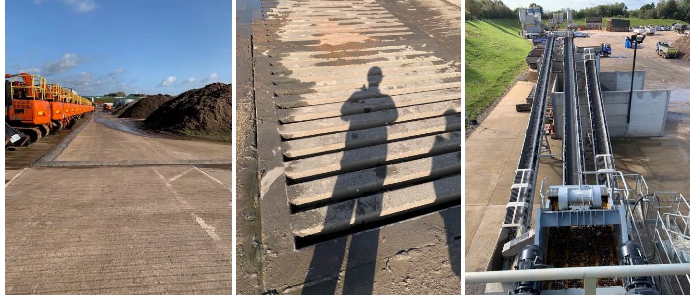
Kerbing around the pad

This was an unannounced inspection. Weather: sunny, calm, 16c. No off-site amenity issues were noted.