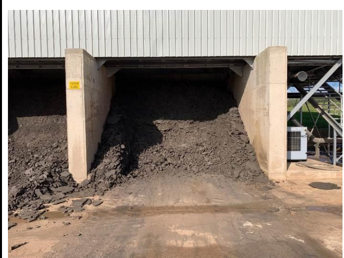
Pressed cake storage bays