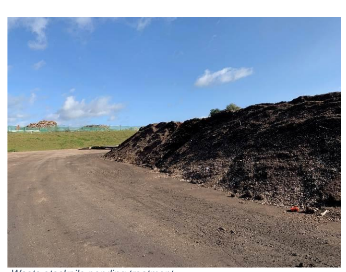
Waste stockpile pending treatment