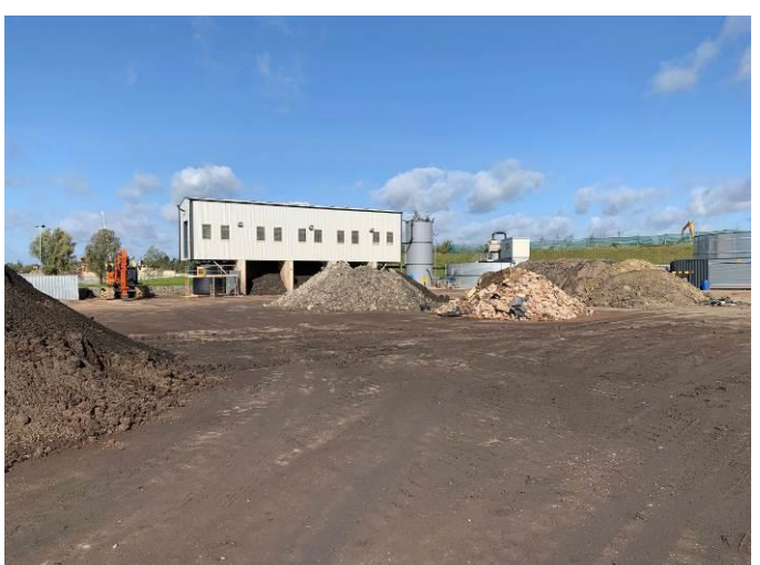
Water treatment plant & press house