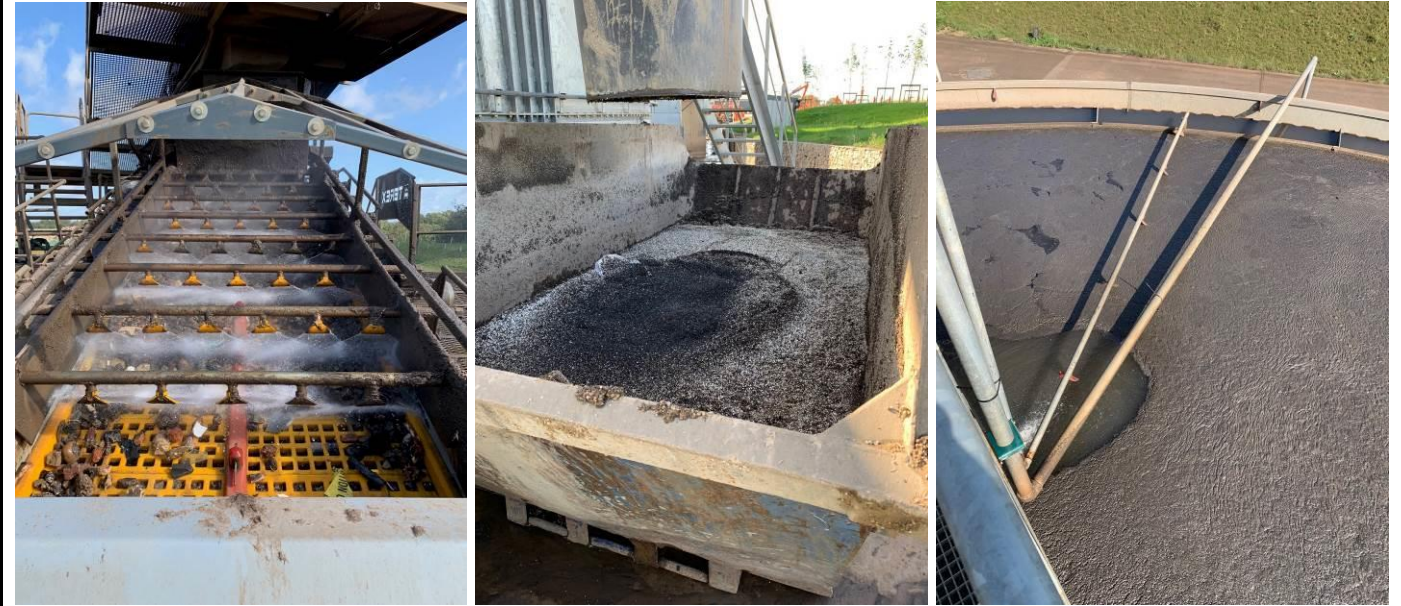
Washing soils off aggregates