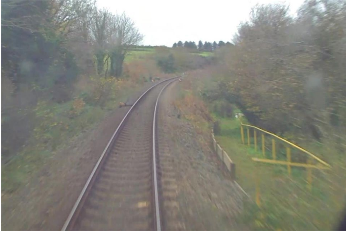
Image from forward-facing CCTV taken from a different train, showing the access point in the foreground and the bridge in the background.

The team was formed of three staff, the PIC (who was also acting as the COSS), and two vegetation clearance operatives, one of whom was acting as a 'site warden' when needed. All three staff were employed by agencies and were working for a principal contractor. Their work involved visiting sites across the area to clear 'strips' of vegetation from cuttings and embankments to allow earthwork inspections to take place at a later date.