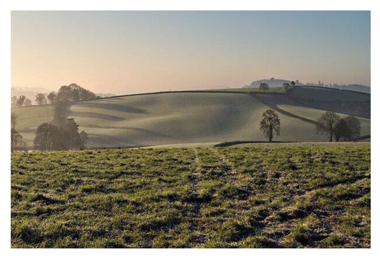
Check your land is eligible

This section contains mandatory scheme requirements.