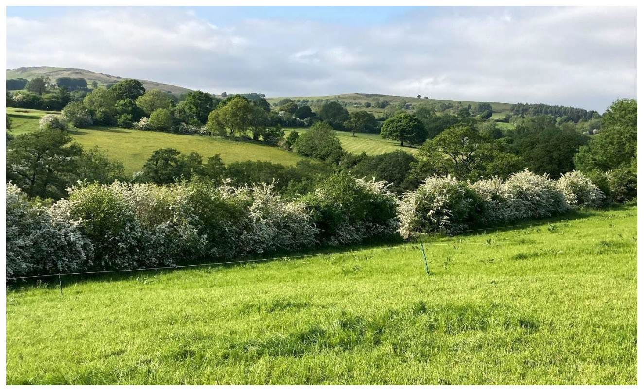
Provide habitat and food sources for farmland wildlife