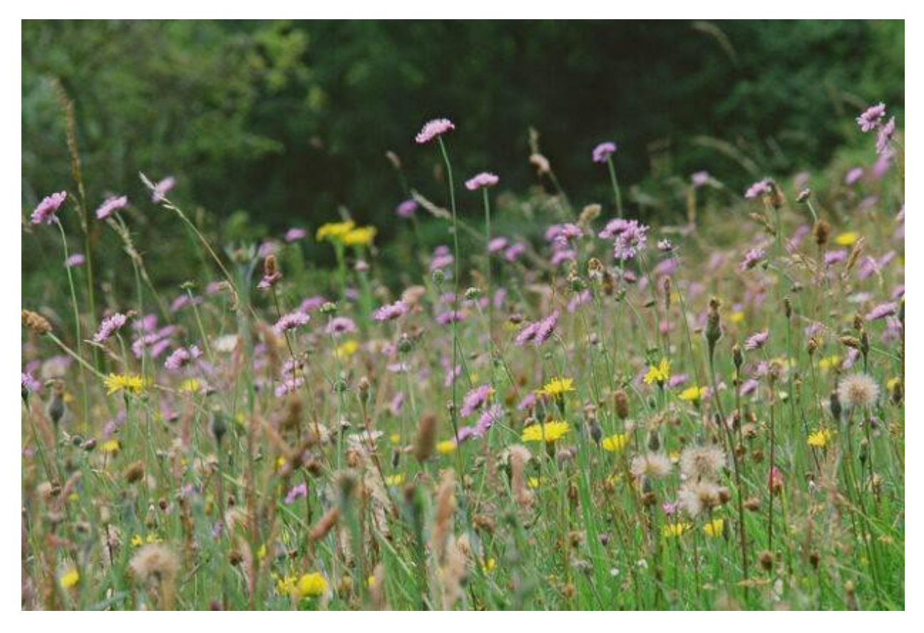
Create habitats to support an IPM approach