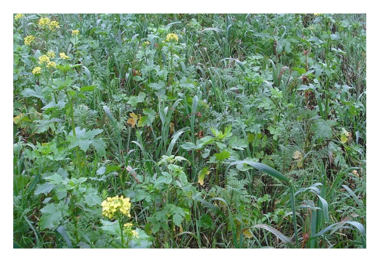
Multi-species winter cover to improve soil health

These actions can help with the long-term productivity and resilience of the soil to benefit food production. They can also provide environmental benefits, such as better water quality, improved climate resilience and increased biodiversity.