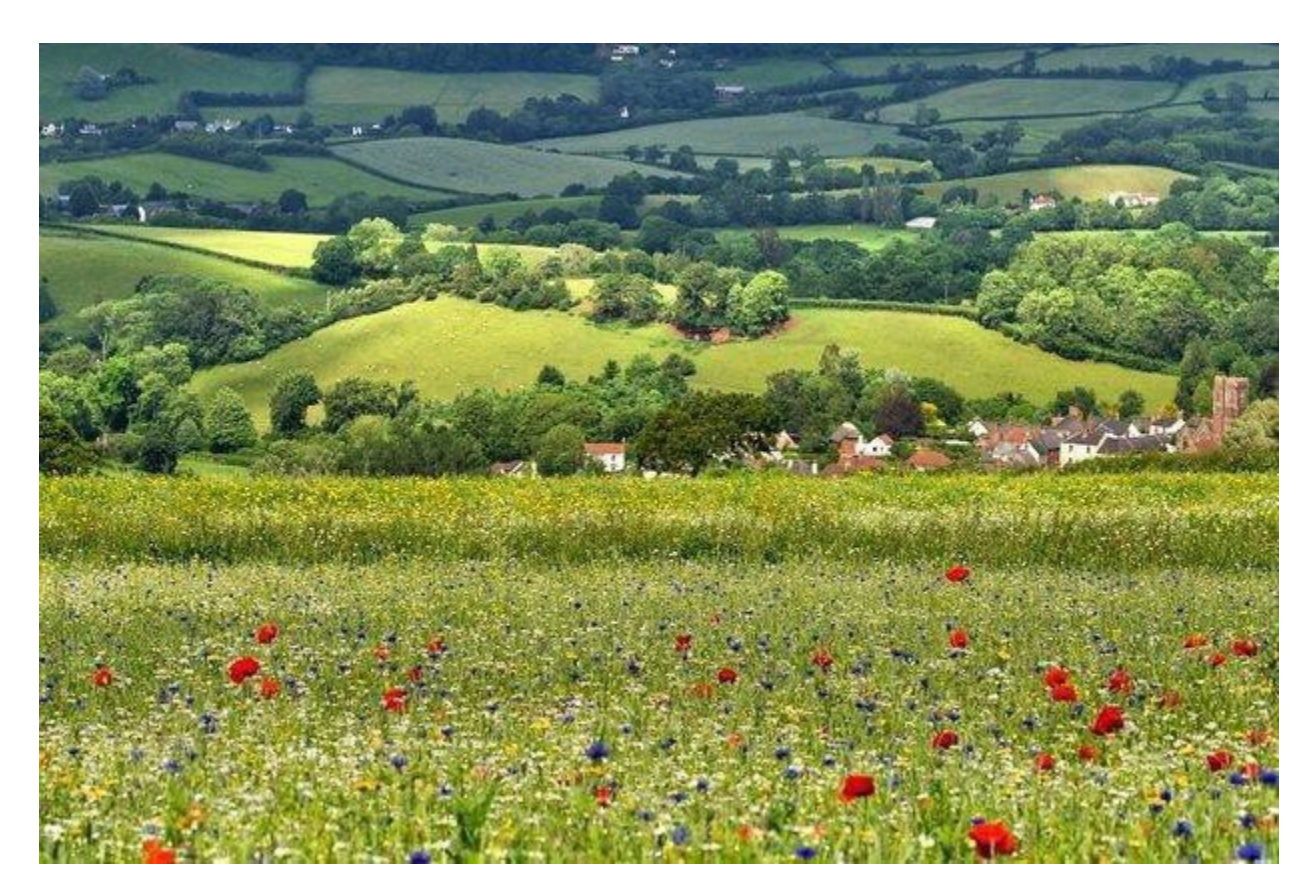
Provide habitat and food sources for farmland wildlife