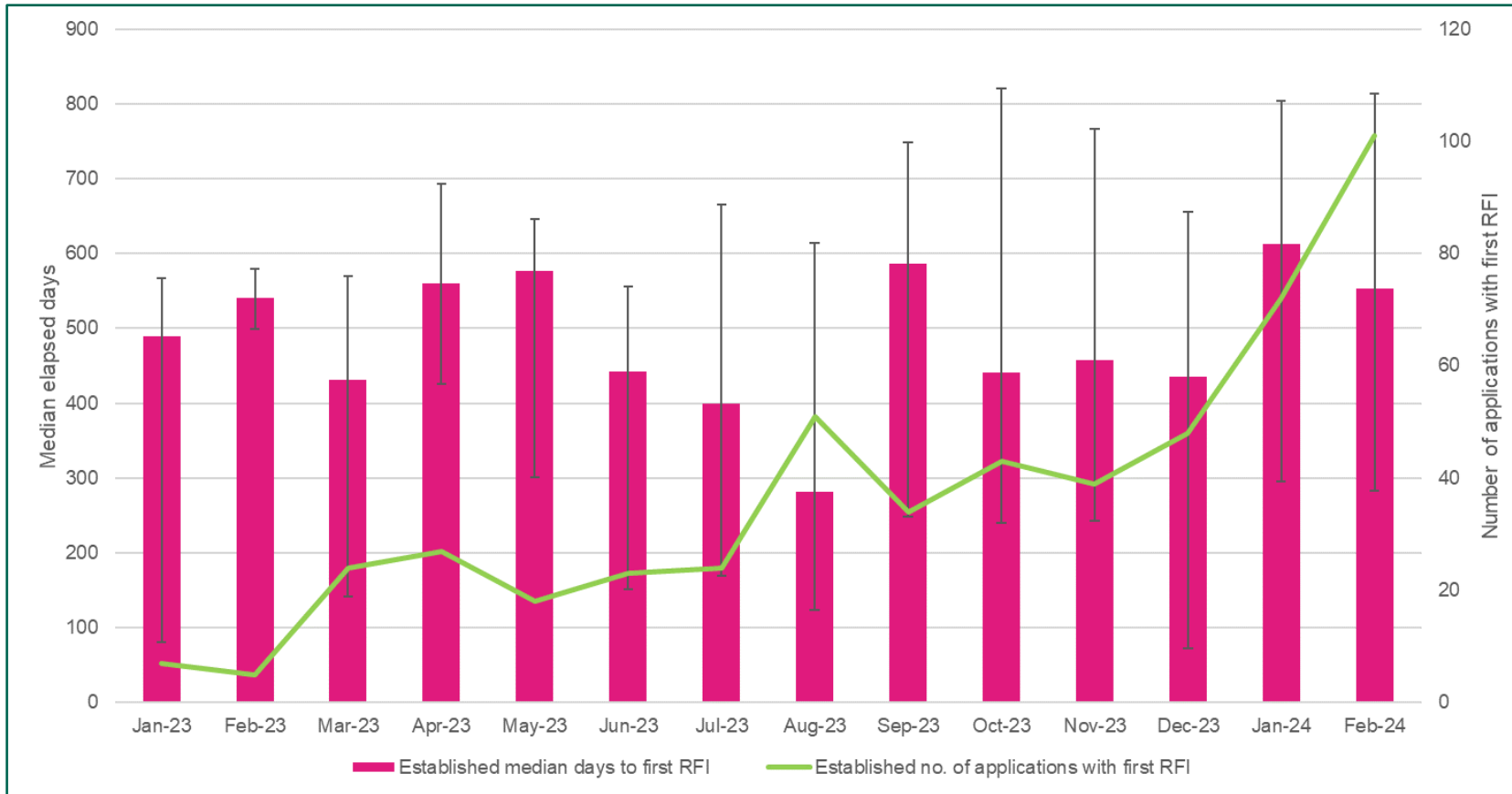
Figure 2. Initial national established licences - median time to first RFI (total elapsed days from received) & number of applications with first RFI for Jan 2023 – Feb 2024

Key features • This graph shows the median number of elapsed days from application received to first RFI. • This includes applications which are being worked through from the queue, which is not truly able to be trended.