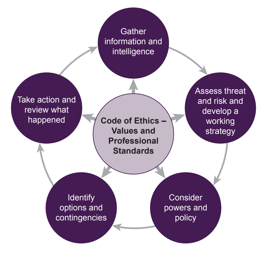
Figure 1: National Decision Model for policing