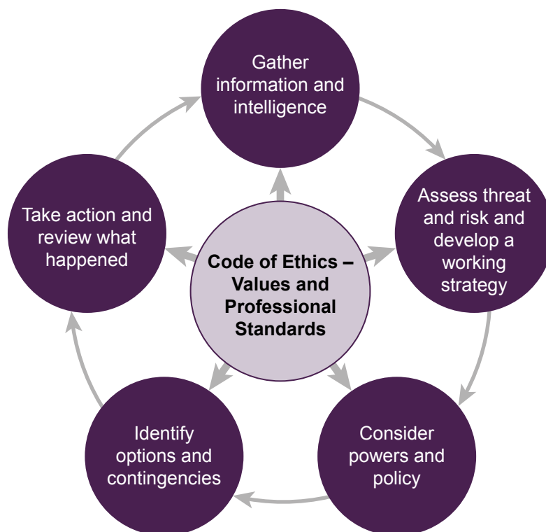
Figure 1: National Decision Model for policing